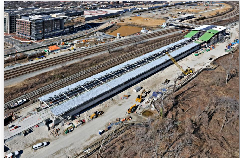
Potomac Yard Station, looking North – as of February 2022