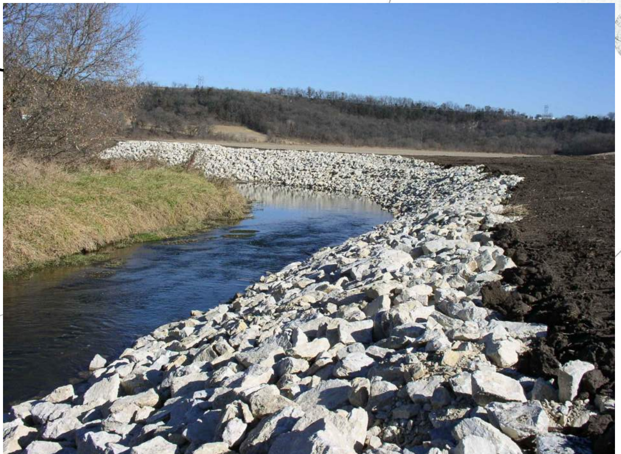
RIPRAP BANK PROTECTION