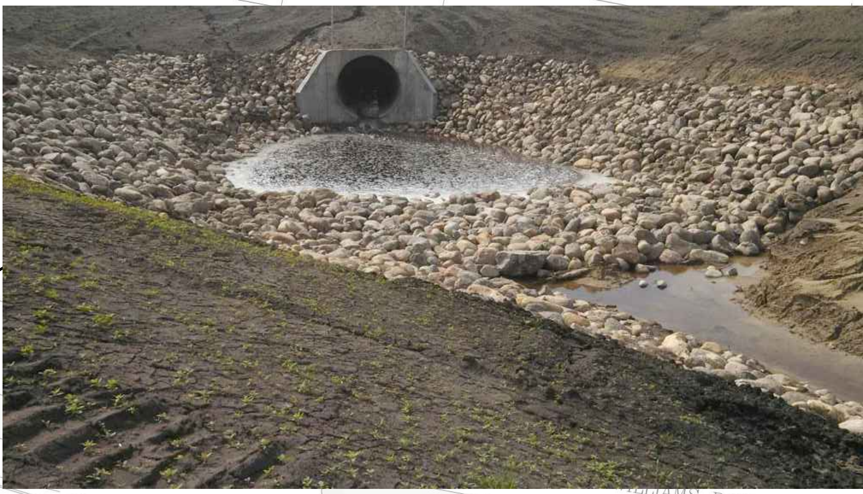
RIPRAP PLUNGE POOL