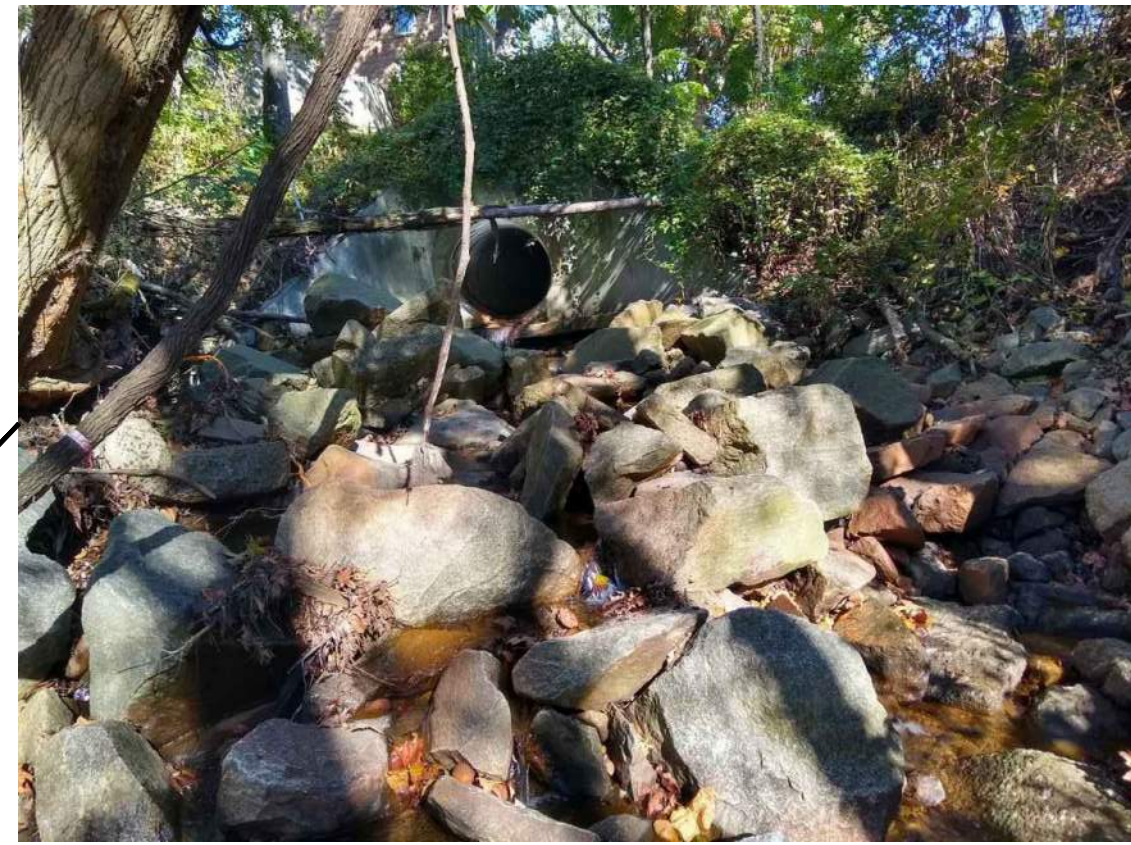
UNDERSIZED SCOUR POOL