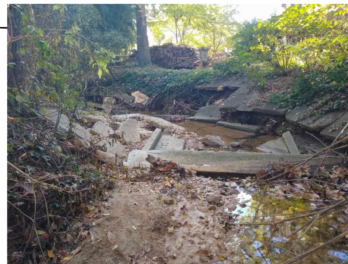
ERODED PRIVATE PROPERTY