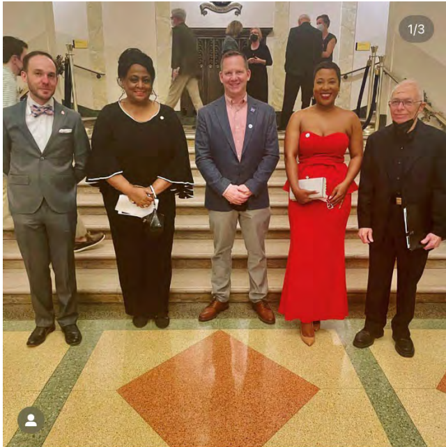
March 2022 Members of Commission at Alexandria Choral Society "Lux: The Dawn from on High" Gala.