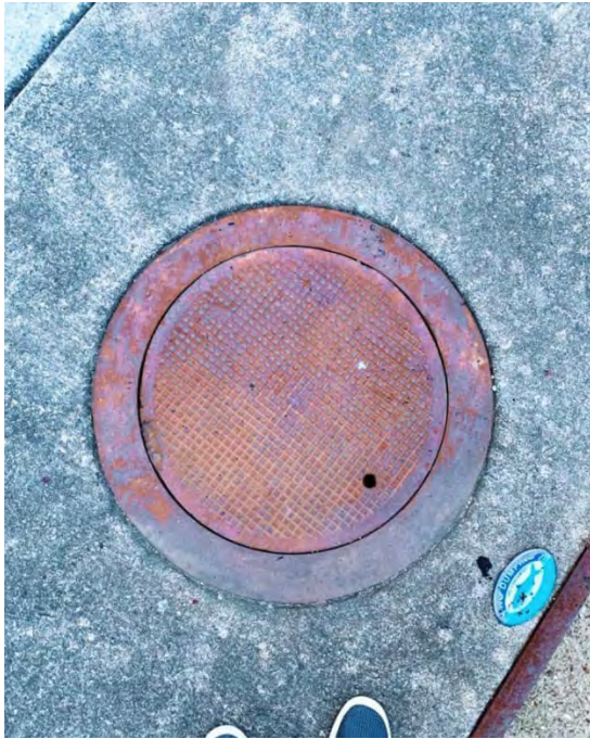
Old Town North Arts District: Stormwater Drain Call for Artists, April 2021