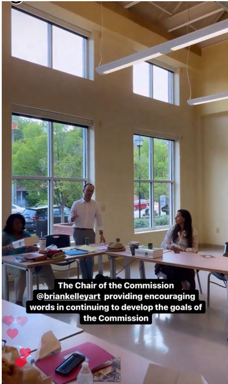
June 2022 Commissioners Spring Retreat at Charles Houston Recreation Center