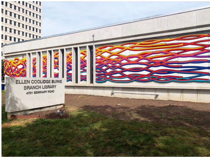
“Confluent Threads” by P1 Studio in September 2021, a public art installation at Burke Library.