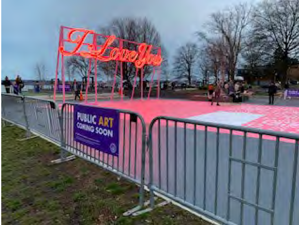
Installation of "I Love You" by R&R Studios at Waterfront Park.