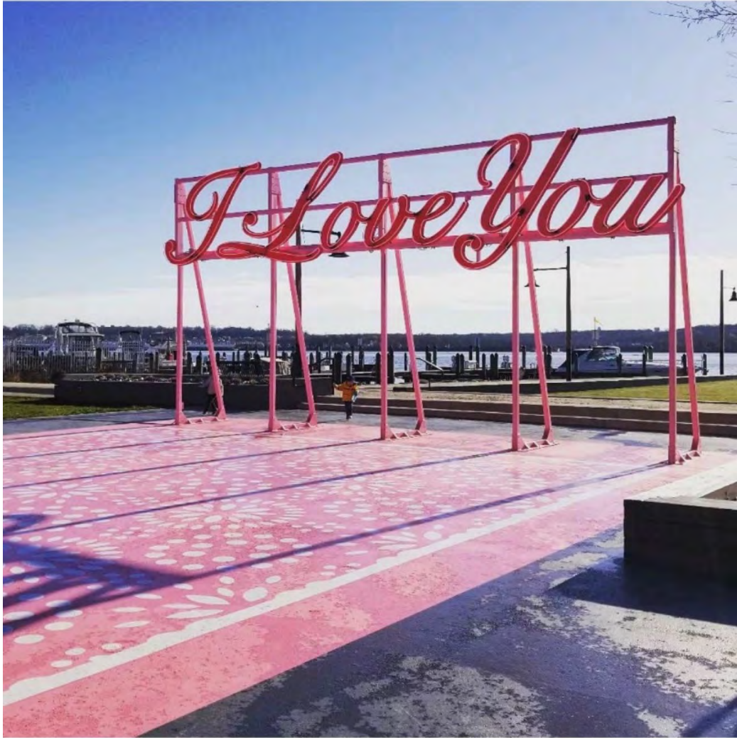
“I Love You” by R&R Studios: A Site/See: New Views in Old Town Waterfront Park Project, Opening Photo March 2022