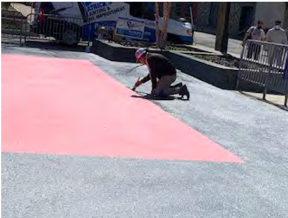
Installation of "I Love You" by R&R Studios at Waterfront Park.