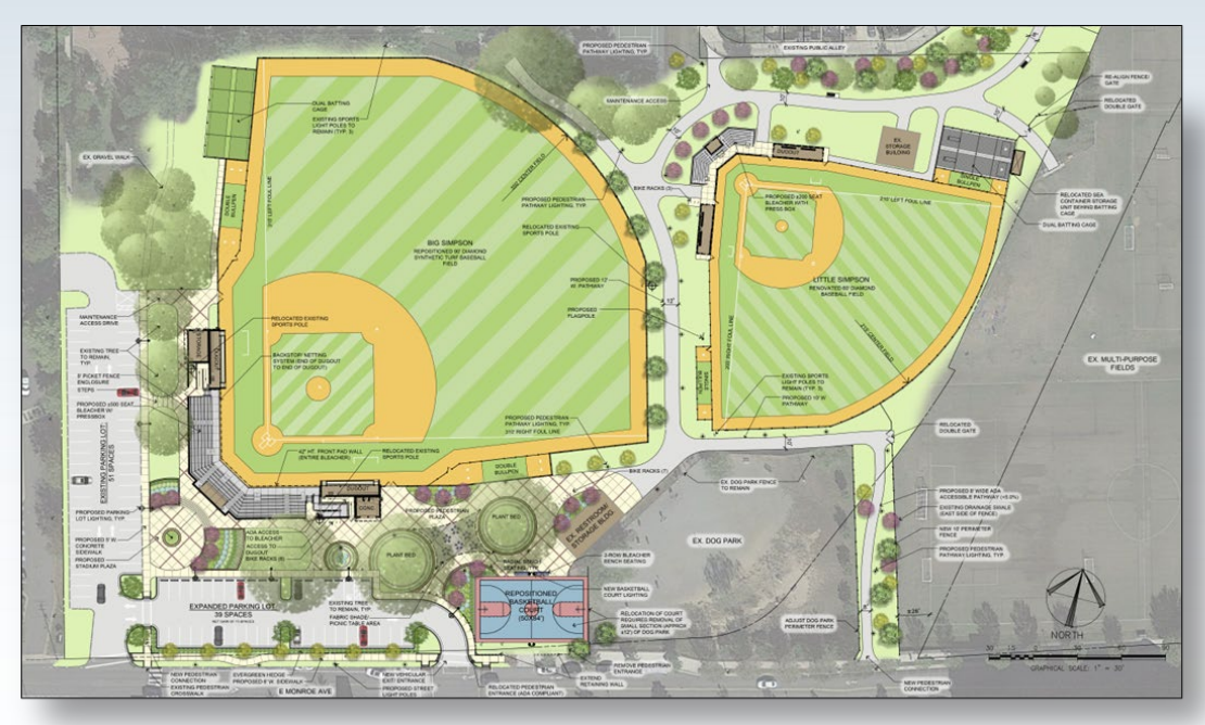
Eugene Simpson Stadium Park Renovation Design