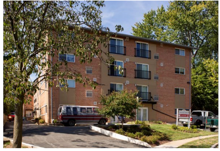
RC Zoning | 54.45 DU/Acre @.73 acres = 39 units