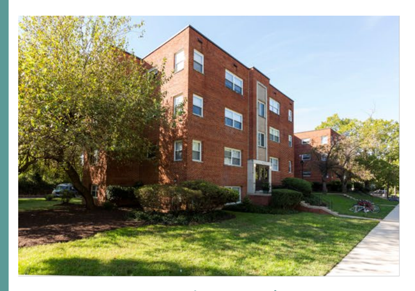
RA Zoning | 27 DU/Acre @1.39 acres = 37 units