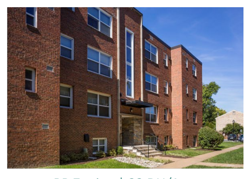
RB Zoning | 22 DU/Acre @.8 acres = 17 units