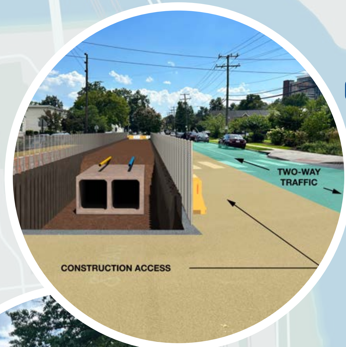
CONSTRUCTION ON COMMONWEALTH AVE Two-way traffic will continue during construction; however parking and bike lanes will be closed.