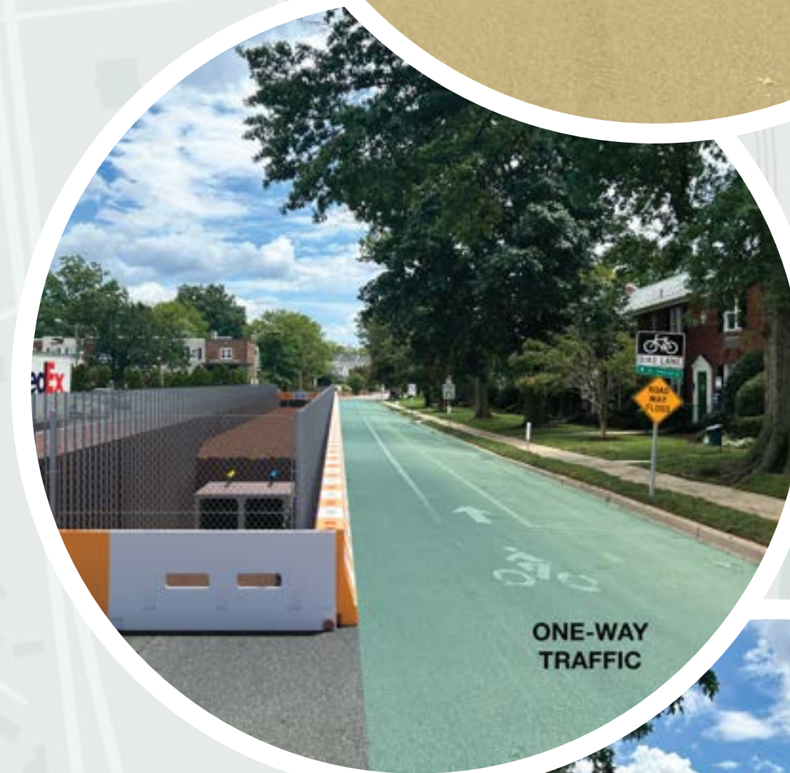
CONSTRUCTION ON GLEBE RD The road will change to one-way traffic during construction and parking lanes will be closed.