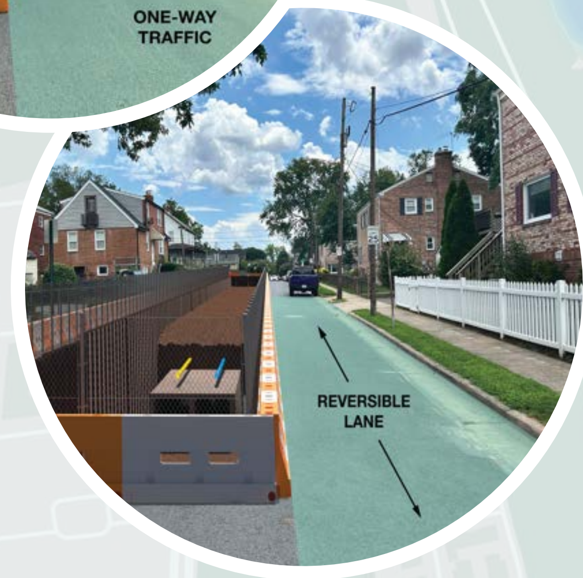
CONSTRUCTION ON MONTROSE AVE A reversible lane will be in effect during construction and parking lanes will be closed.