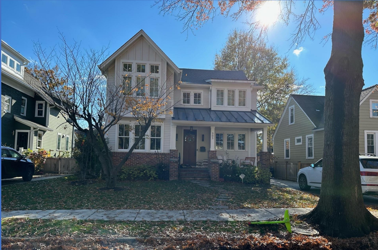
303 East Oxford Avenue