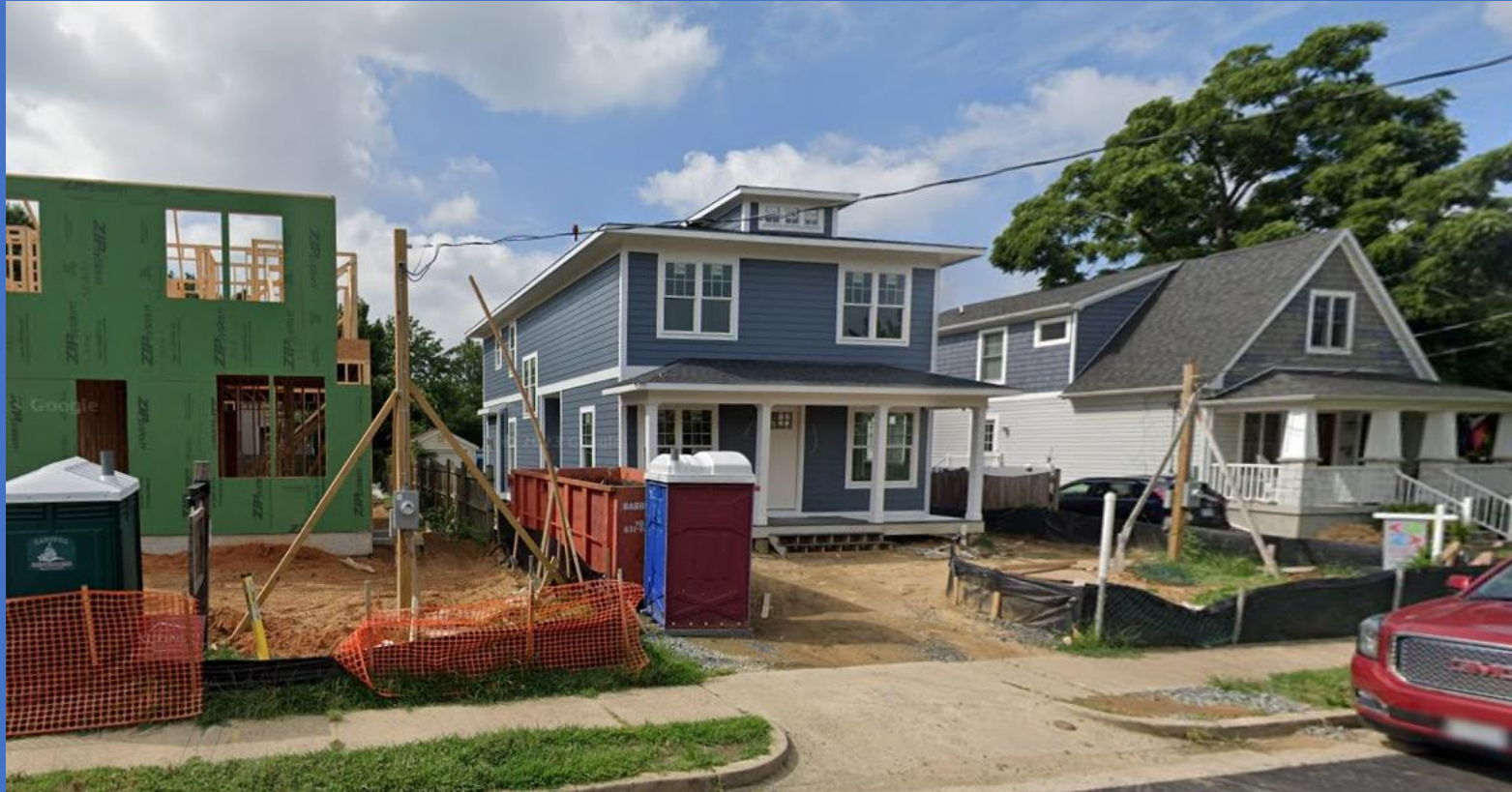
109 Stewart Avenue