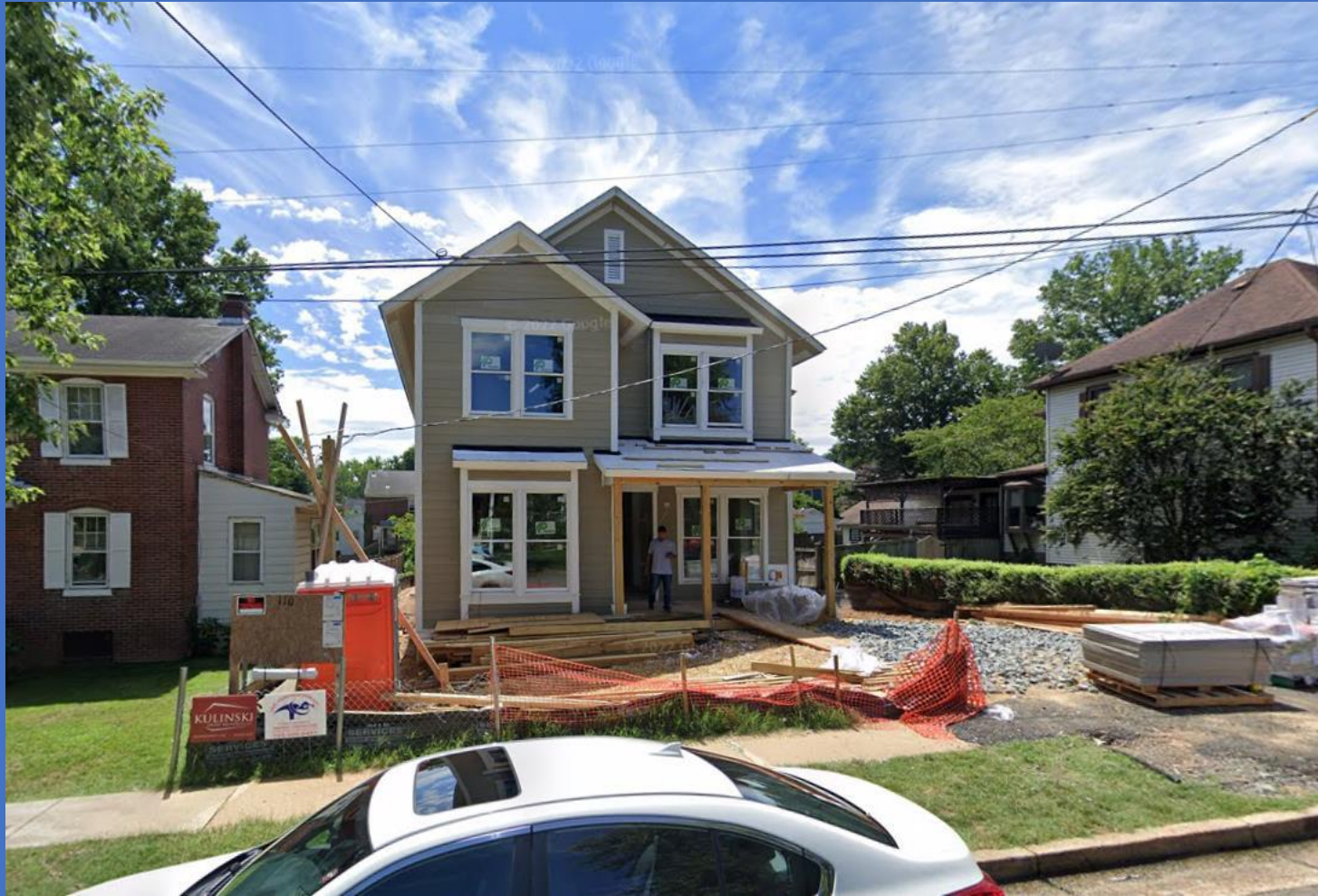
110 West Nelson Avenue