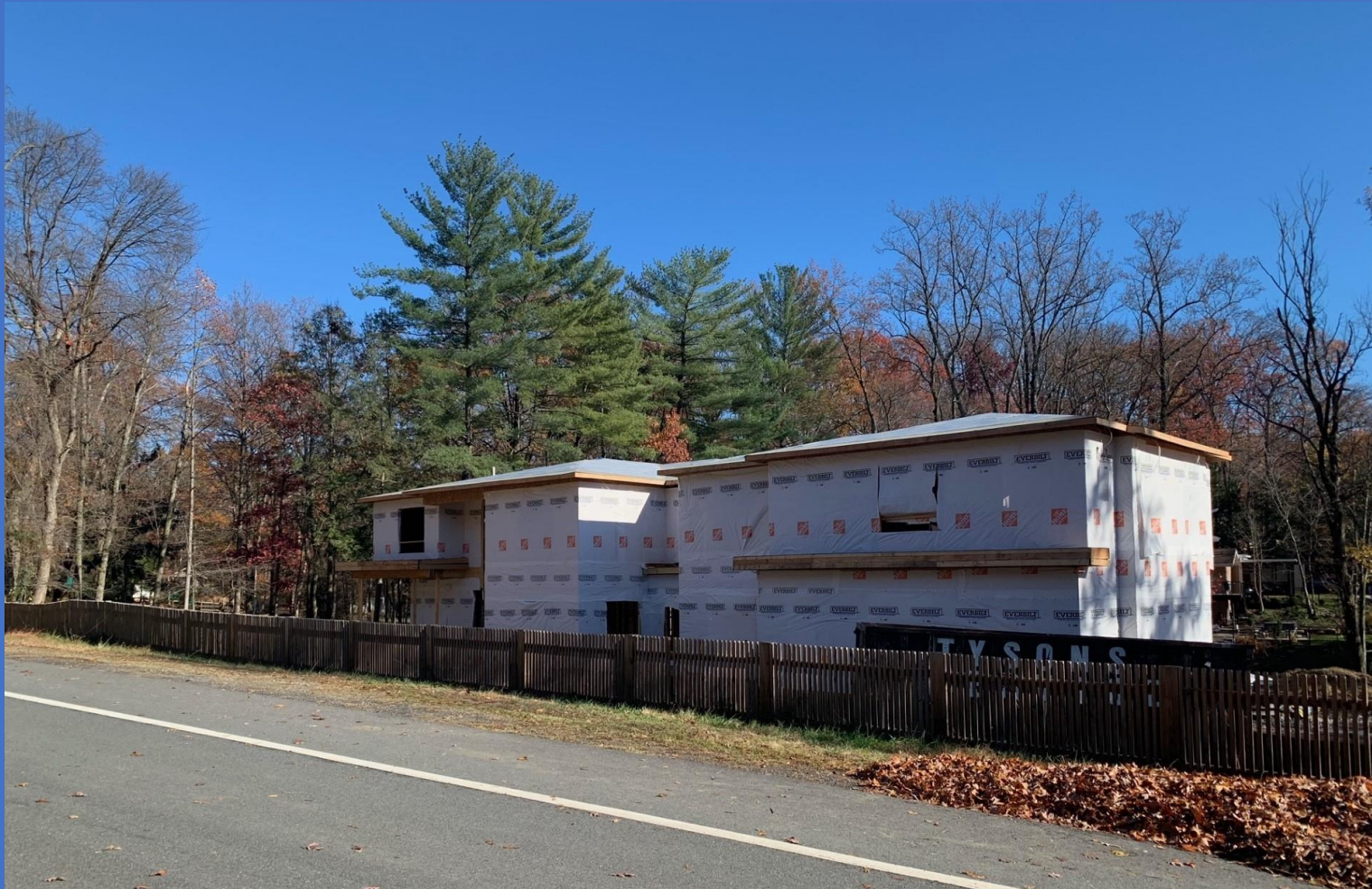
1321 North Pegram Street