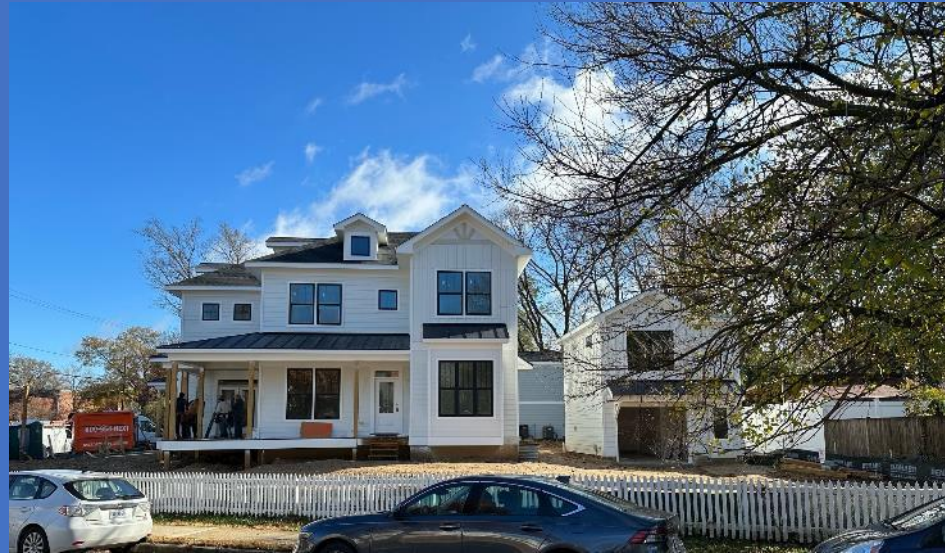
View facing Commonwealth

A two-family semi-detached dwelling, each with a detached ADU.