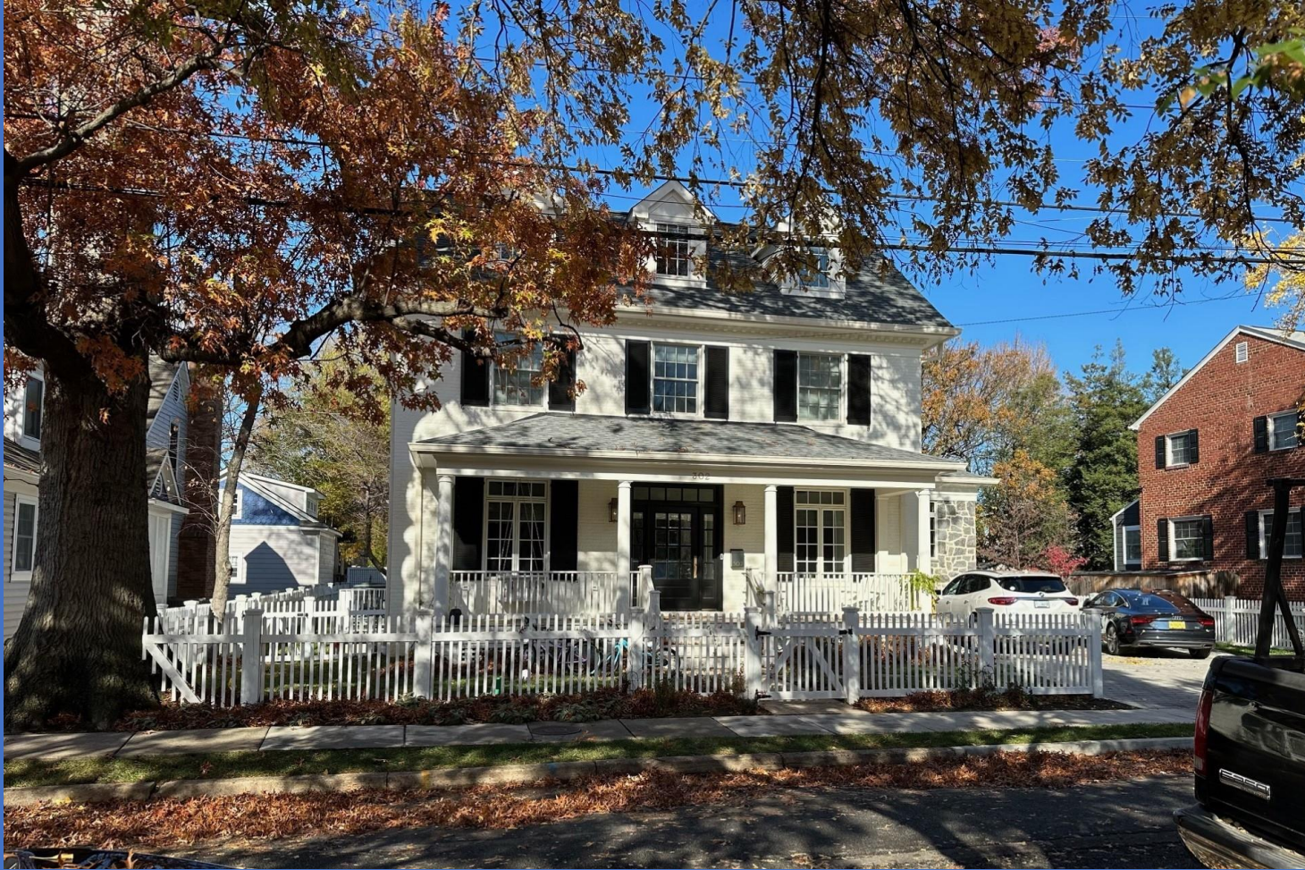
302 East Del Ray Avenue