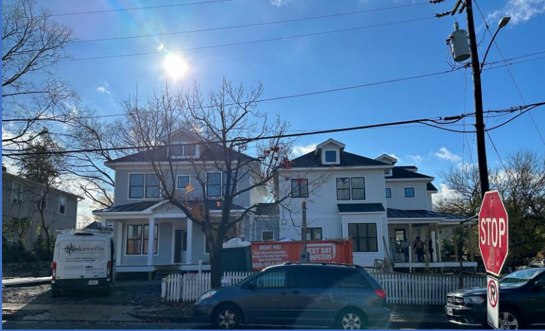
View facing Uhler