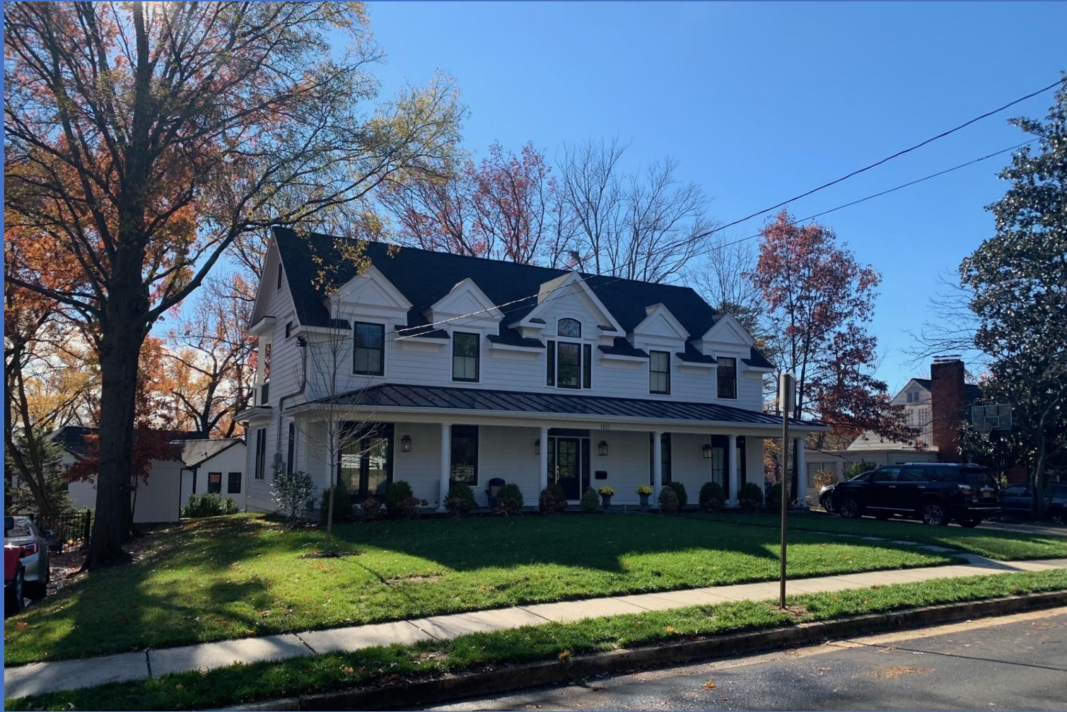
1102 Vassar Road