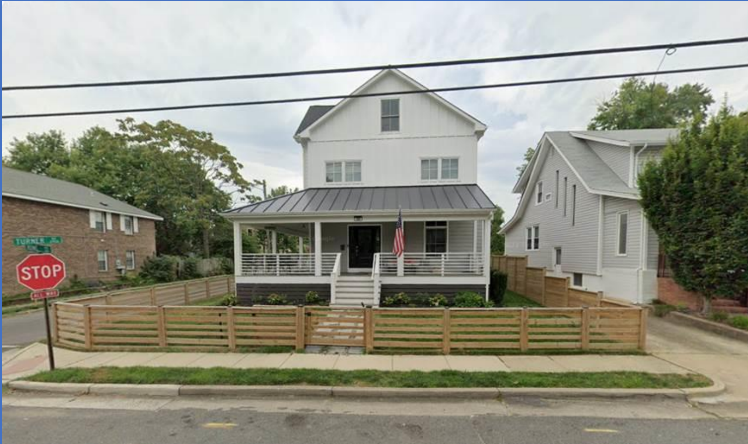
300 Hume Avenue