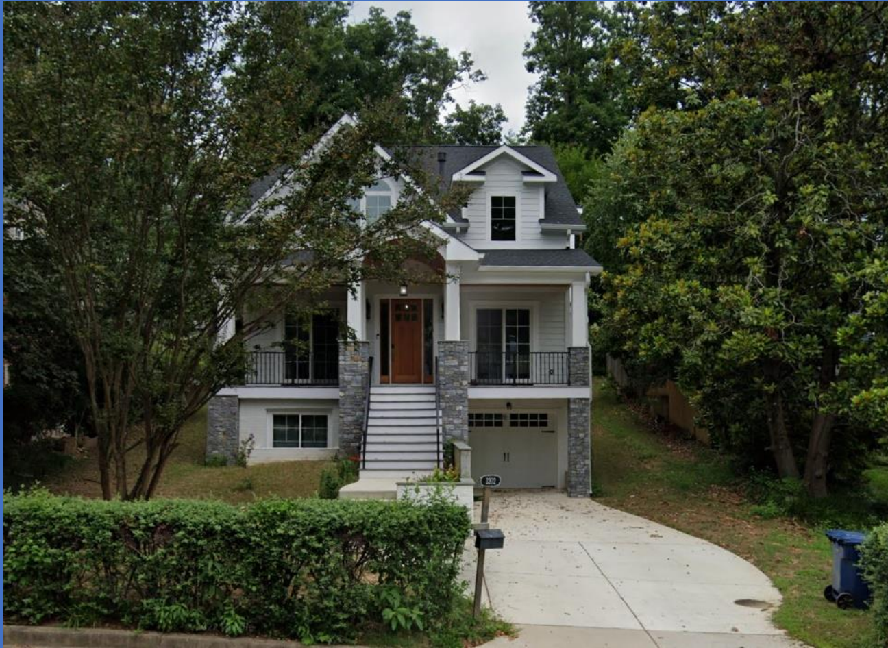
3202 Old Dominion Blvd