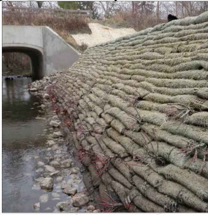
VEGETATED WALL EXAMPLE (RECENTLY INSTALLED)

NOTES: 1. VEGETATED WALL SHALL BE COMPOSED OF PERMANENT SEEDED BAGS OR EQUIVALENT AND ANCHORED IN PLACE.