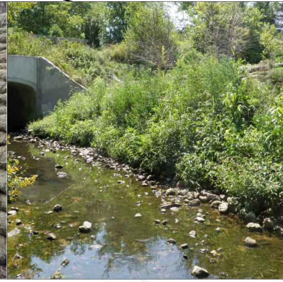
VEGETATED WALL EXAMPLE (1-2 YEARS POST-CONSTRUCTION)

SOURCE DATA INFORMATION H.D. = VCS NAD 83 V.D. = NAVD 88 GIS INFO = CITY & 2019 BOWMAN SURVEY SCALE: 1"=30'