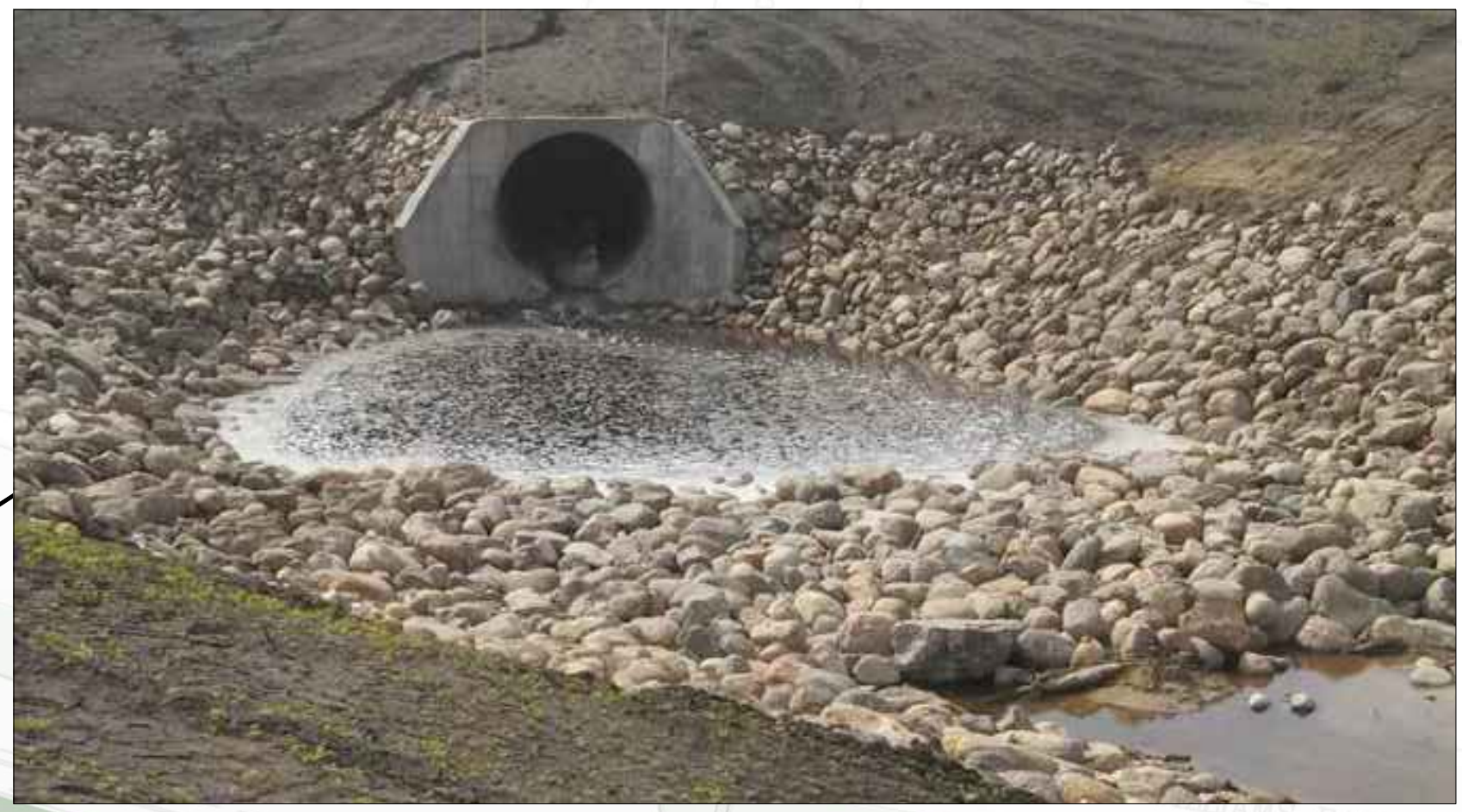
RIPRAP PLUNGE POOL