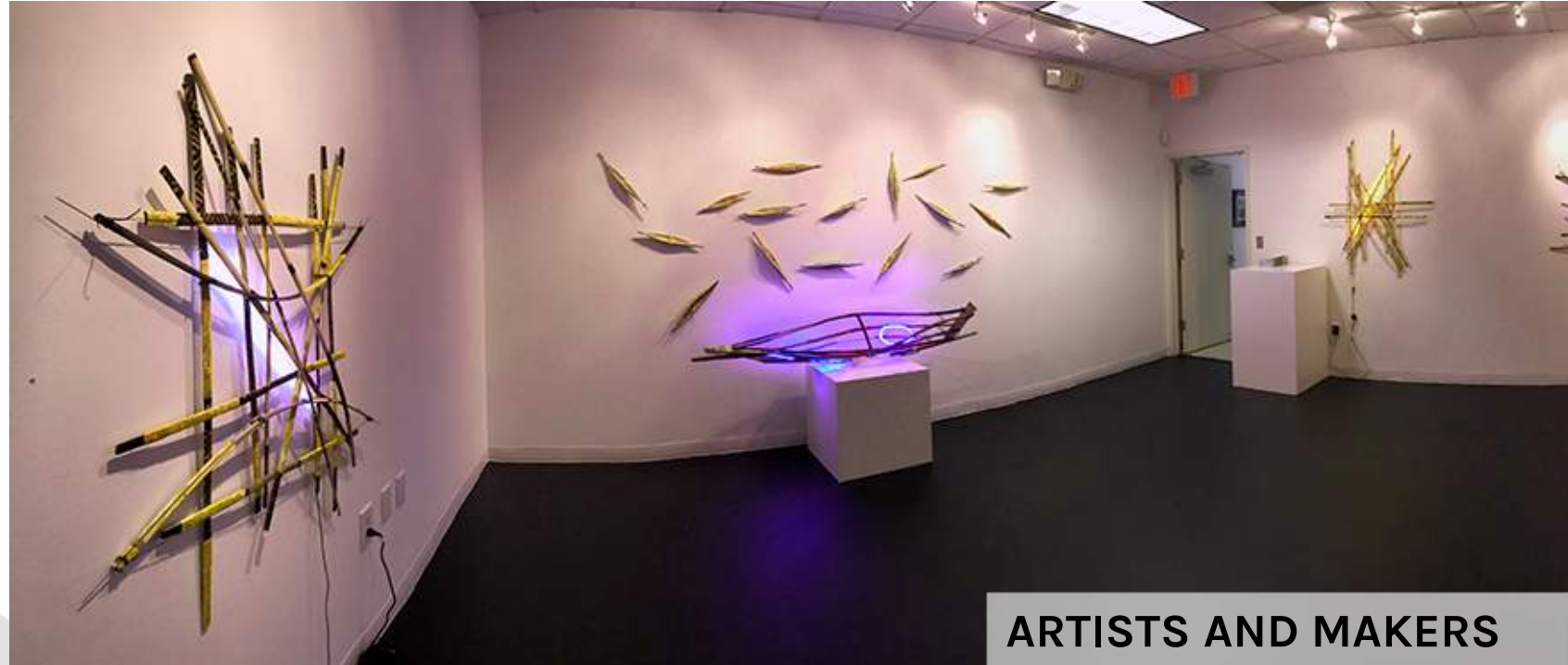
ARTISTS AND MAKERS