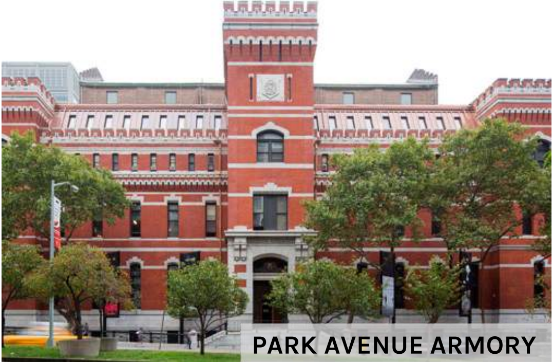
PARK AVENUE ARMORY