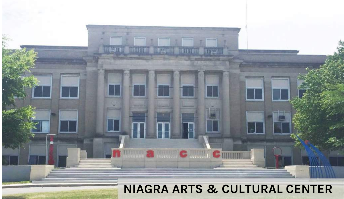
NIAGRA ARTS & CULTURAL CENTER