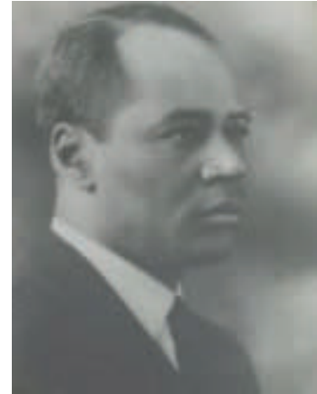
Charles Hamilton Houston

In June 2007 City Council endorsed a concept of incorporating into the new Charles Houston Recreation Center a work of public art to honor and memorialize Charles Houston and to recognize the historical importance of the former Parker-Gray High School to the community which surrounds the Center. Members of the Commission for the Arts conducted a series of one-on-one outreach meetings between July 2007 and May 2008 with the Charles Houston Parent Advisory Board, the Parker-Gray Alumni Association, and the Departmental Progressive Club.