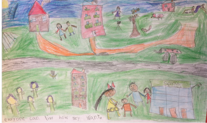
Fair housing through the eyes of a kindergartener at William Ramsey Elementary

talk, how they choose to worship, the language they speak at home, or a disability.