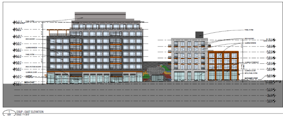
Rendering of the site's east elevation

DISCUSSION: Consistent with the Housing Master Plan's recommendation to focus affordable housing in areas near jobs, amenities, and services and with the greatest potential for increased density and mixed-use development, the applicant has proposed using bonus density, Sec. 7-700. (It is noted that the applicant has also proposed using bonus density for the arts, Sec. 6-900.) In exchange for 30% (29.99%) bonus density for affordable housing, the applicant will provide 22 on-site committed affordable rental set-aside units.