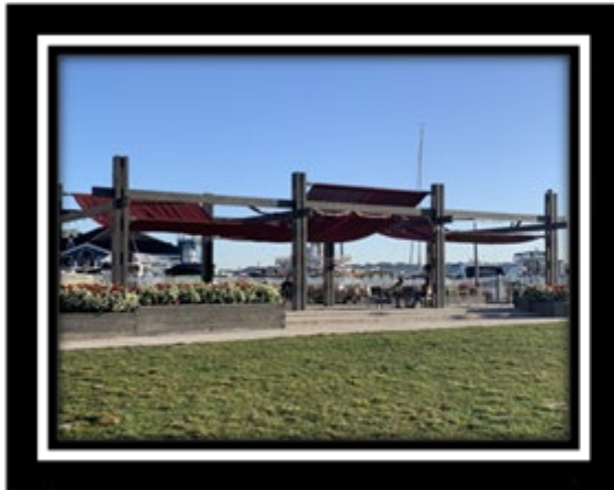
Waterfront Park. New awnings installation.