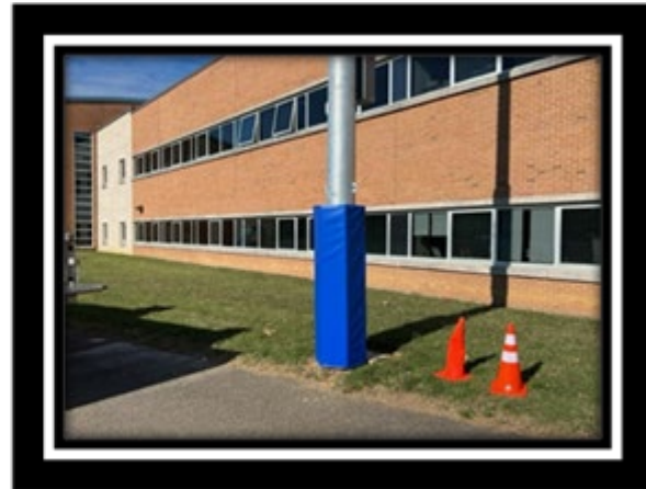
Francis C. Hammond Light pole pad installation