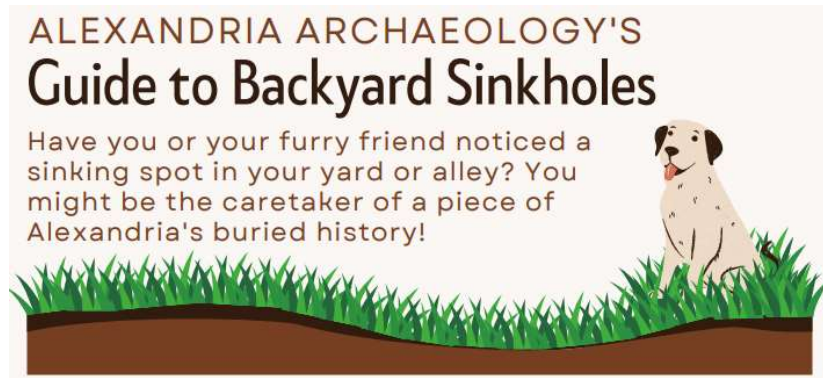
AA's online resource to encourage residents to protect our buried past.

assumed the role of archaeology educators, reaching out to community organizations to share information on how to properly and safely treat backyard wells and privies, including an article in the Old Town Civic Association newsletter.