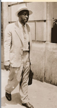
Alexandria Black History Museum