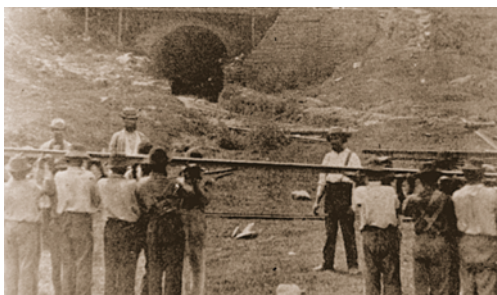
Richard Dodson Collection

development. Quakers supported the growth of Hayti by renting and selling property to free black families. Today, several wood and brick townhouses still survive on the 400 block of South Royal and the 300 block of South Fairfax streets. The Wilkes Street Tunnel, built for the Orange and Alexandria Railroad in 1856, is a Hayti landmark.