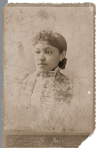
Alexandria Black History Museum