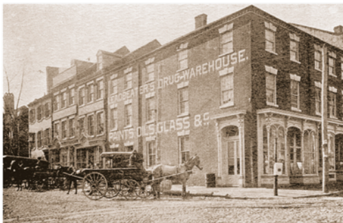
Stabler-Leadbeater Apothecary Museum