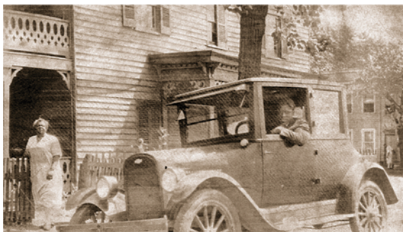
Home in Uptown Neighborhood, circa 1926

The Uptown neighborhood developed before the Civil War. By 1870, with many African Americans migrating to Alexandria during and after the War, Uptown grew into a large neighborhood. Many black churches developed here. The Parker-Gray historic district protects the historic structures in Uptown . The total area of Uptown is about 24 blocks, making it the largest of the historic African American neighborhoods in Alexandria.