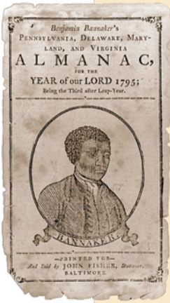
The Maryland Historical Society, Baltimore, MD

Benjamin Banneker, considered the “first black man of science,” was a self-educated black mathematician and astronomer. Thomas Jefferson declared Banneker’s 1792 Almanack “proof...that nature has given our black brethren, talents equal to that of other colors of men, and that the appearance of a want of them is owing merely to the degraded condition of their existence...” Banneker, while assisting with the capital survey, recreated from memory the entire plan for the new capital city of Washington when Pierre L’Enfant, the original planner, quit and took the plans with him.