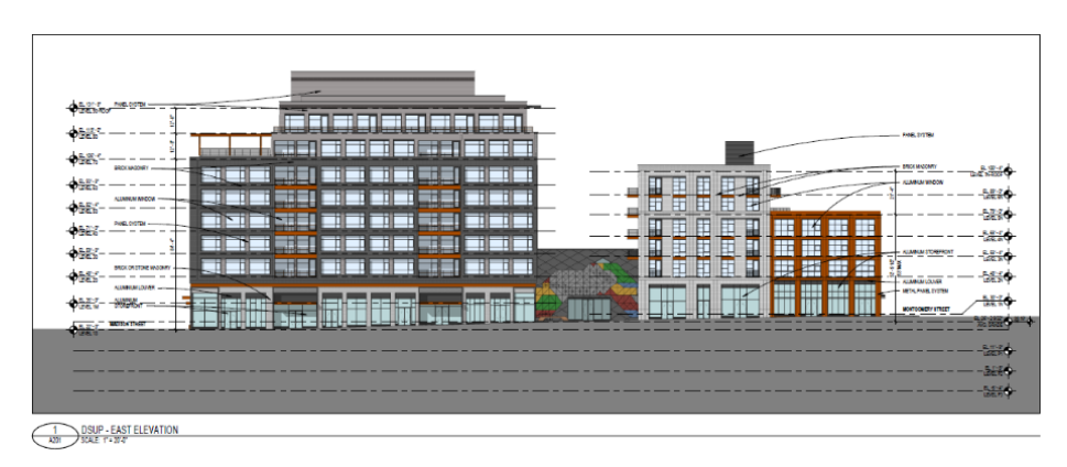
Rendering of the site's east elevation

DISCUSSION: Consistent with the Housing Master Plan's recommendation to focus affordable housing in areas near jobs, amenities, and services and with the greatest potential for increased density and mixed-use development, the applicant has proposed using bonus density, Sec. 7-700. (It is noted that the applicant has also proposed