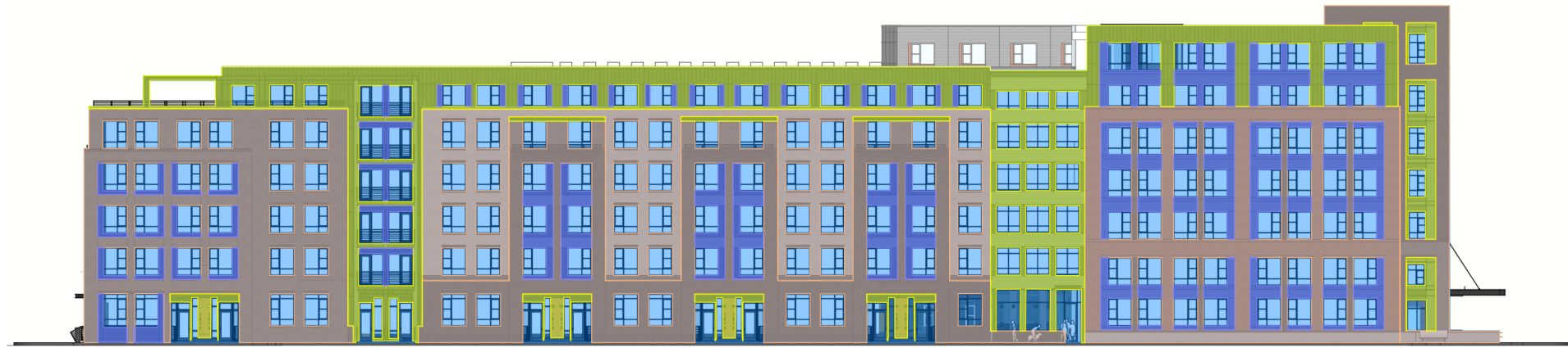
N. FAIRFAX STREET ELEVATION