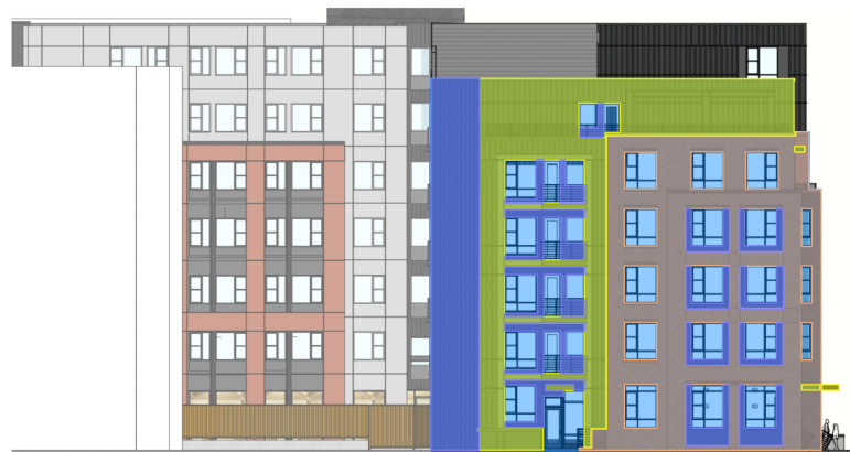
PENDLETON STREET ELEVATION