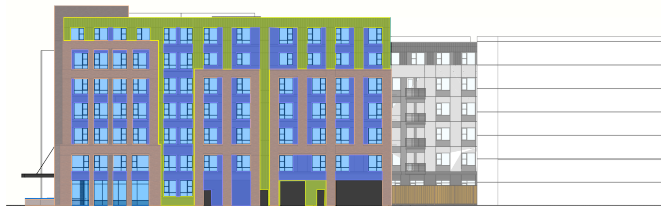
N. ROYAL STREET ELEVATION