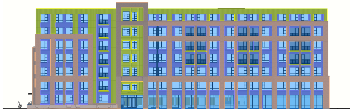
WYTHE STREET ELEVATION