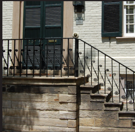
Example of historically appropriate stone steps, iron handrail and guardrail on a Georgian style residence.