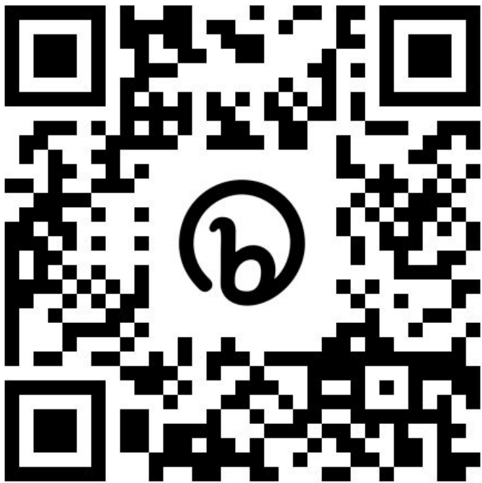
Real Estate Assessment