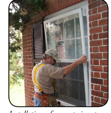
Installation of an exterior storm window.