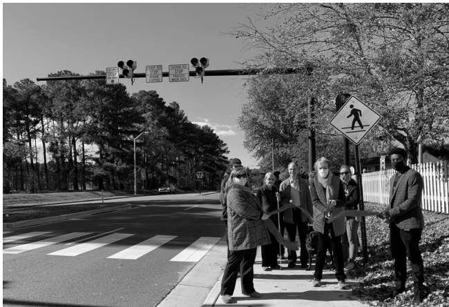
Ribbon cutting for the new HAWK signal on Braddock Road near Minnie Howard