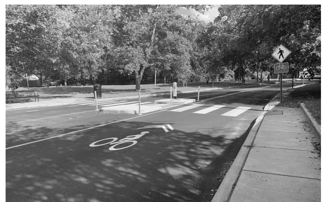
New pedestrian refuge island on Commonwealth Avenue near King St Metro

Van Dorn St & Courtney Ave | Van Dorn St & Eisenhower Ave | Van Dorn St (driveways and side streets between Courtney Ave & Stevenson Ave) | Seminary Rd & Colfax Ave | Seminary Rd & Dover Pl | Seminary Rd & Echols Ave | S Pickett St & West End Village Shopping Center | Patrick St & First St | Henry St & First St | Henry St & Montgomery St | Patrick St & Montgomery St | Henry St & Madison St | Patrick St & Madison St | Henry St & Wythe St | Patrick St & Wythe St | Henry St & Pendleton St | Patrick St & Pendleton St | Henry St & Oronoco St | Patrick St & Oronoco St | Henry St & Princess St | Patrick St & Princess St | Henry St & Queen St | Patrick St & Queen St | Edsall Rd & S Whiting St | Stevenson Ave & S Walker St | N Van Dorn St & Taney Ave | N Van Dorn St & Richenbacher Ave/Sanger Ave | King St & Royal St | King St & Fairfax St | Braddock Rd & N Hampton Dr