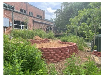
The retention wall in the garden will be a sitting/standing area for garden classes.