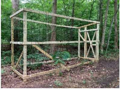
Deer exclosure at DKNP.