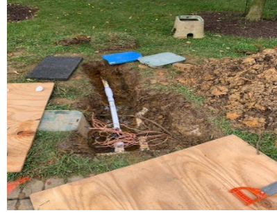
Irrigation repairs continued.