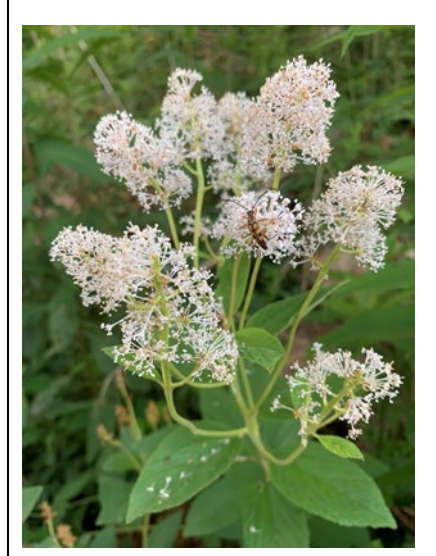
New Jersey Tea.