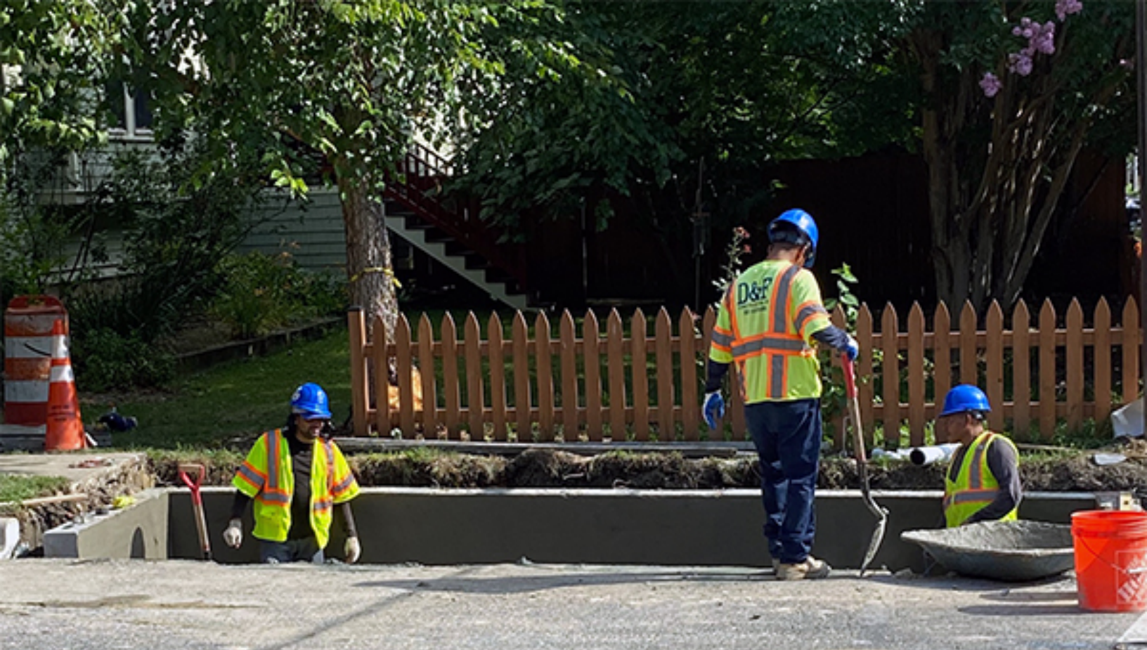
Contractors from D&F Construction break ground to install larger storm drain inlets on West Del Ray Avenue on July 25.

Construction began on new, larger storm drain inlets for West Del Ray Avenue – with construction for East Del Ray Avenue not far behind.