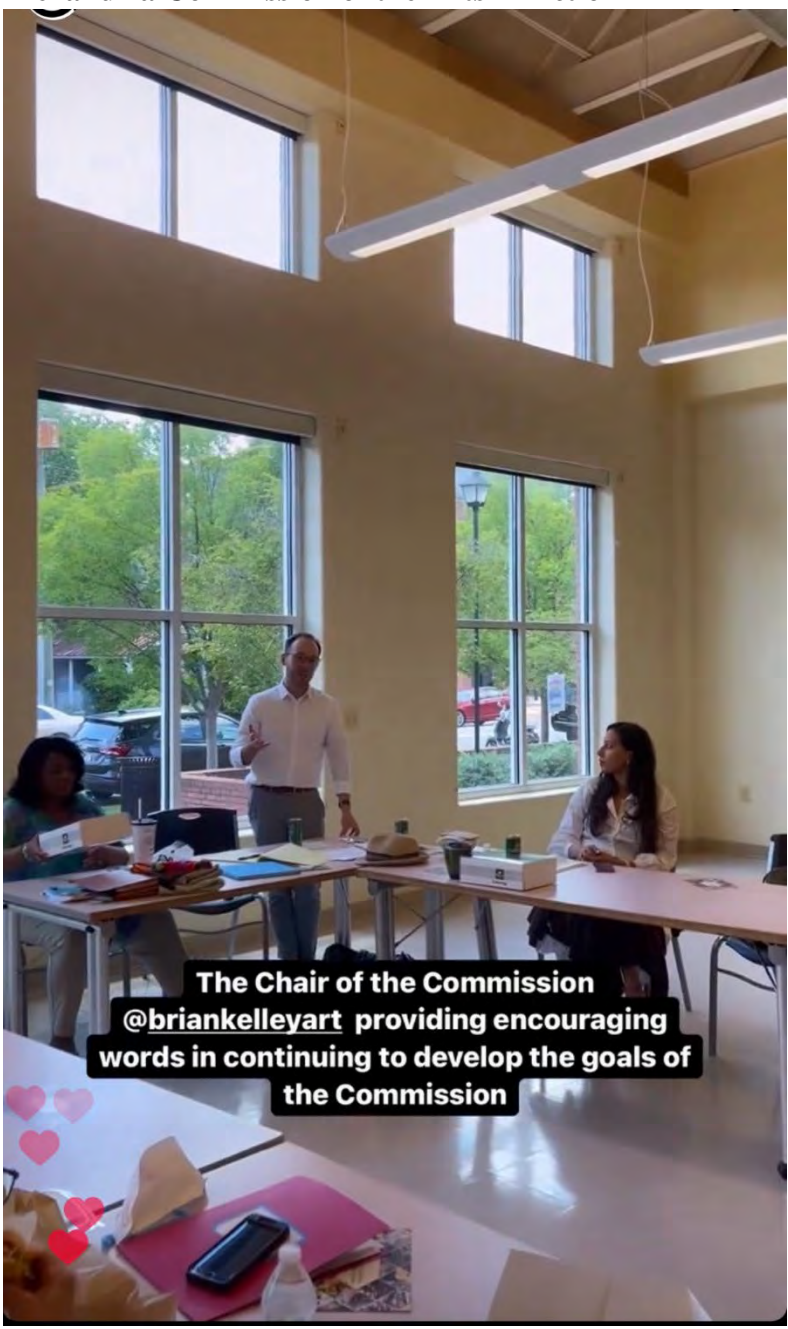
June 2022 Commissioners Spring Retreat at Charles Houston Recreation Center