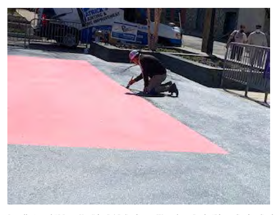
Installation of "I Love You" by R&R Studios at Waterfront Park.