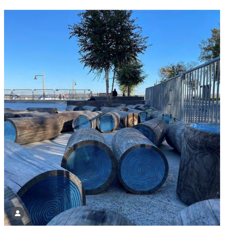
Removal of "Groundswell" by Mark Reigelman; a Site/See Waterfront Park Project.