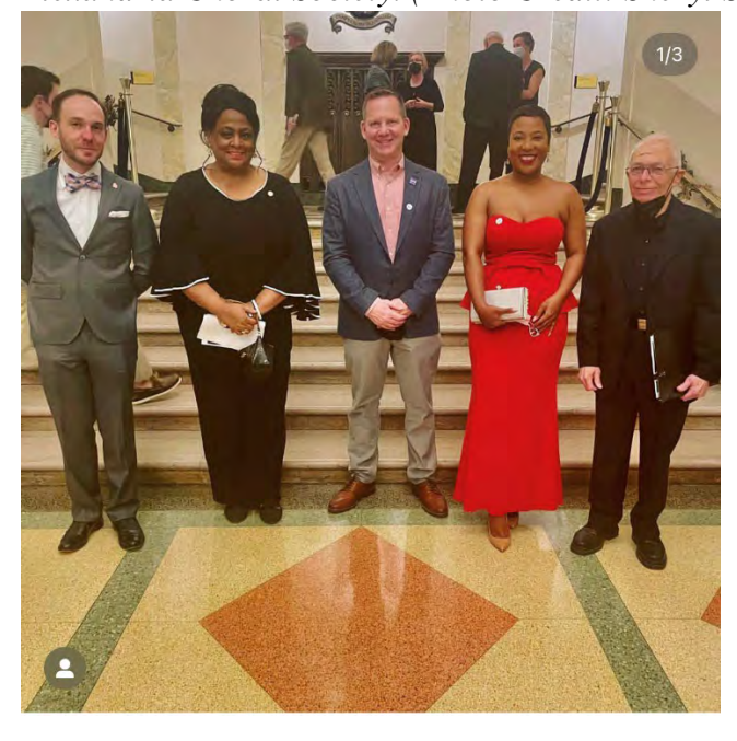
March 2022 Members of Commission at Alexandria Choral Society "Lux: The Dawn from on High" Gala.