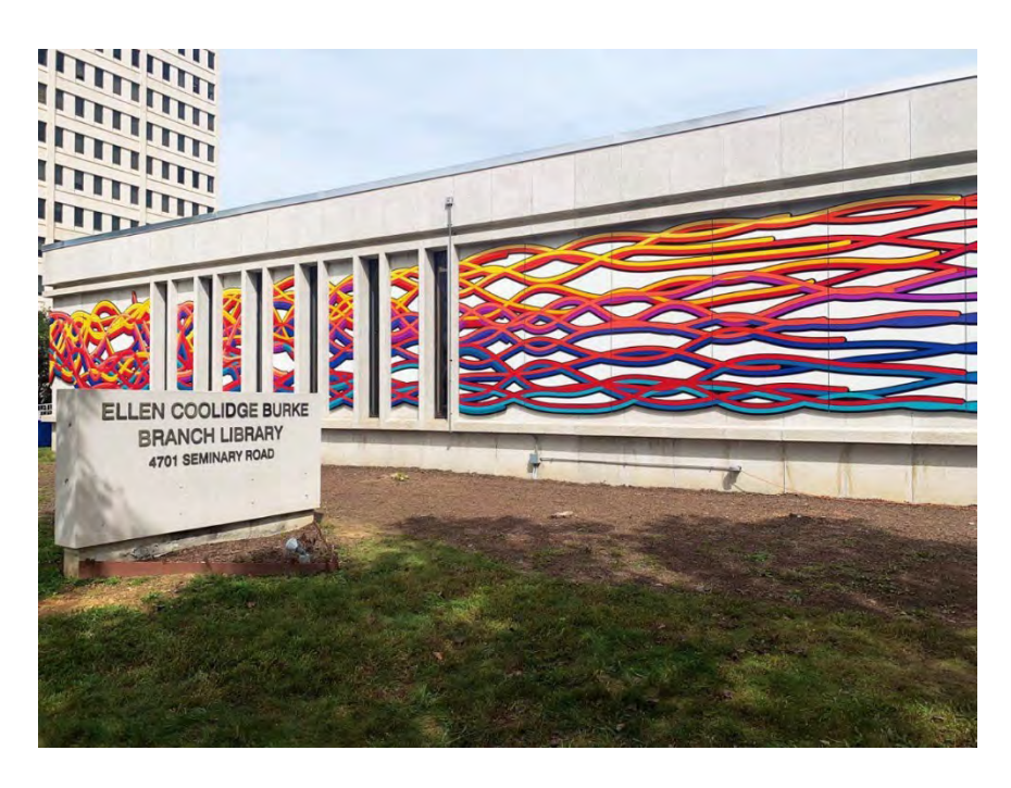
"Confluent Threads" by P1 Studio in September 2021, a public art installation at Burke Library.