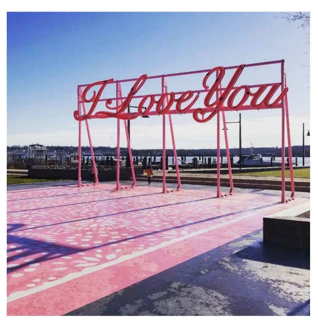
"I Love You" by R&R Studios: A Site/See: New Views in Old Town Waterfront Park Project, Opening Photo March 2022