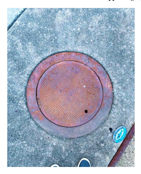
Old Town North Arts District: Stormwater Drain Call for Artists, April 2021