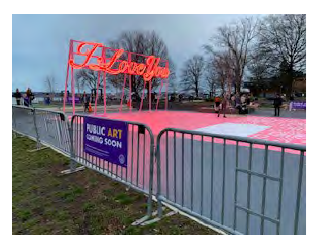
Installation of "I Love You" by R&R Studios at Waterfront Park.