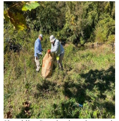
Chambliss Crossing invasive exotic plant removal project.