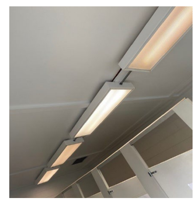
Old light fixtures @ Four Mile.