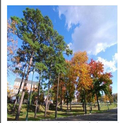
Old-age grove of Shortleaf Pine and fall color ant Armistead Boothe Park.