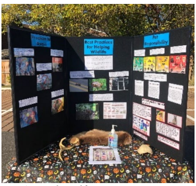
Animal Welfare League event information.