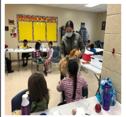
Animal camouflage outreach program in action.