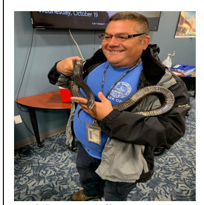
Park Services Fall Training Event.

The garden season continues through November 30. Initial renewal notices for the 2023 gardening season have been sent to all gardeners. There will be 2 more email notices sent to those who have not responded to the first notice, so existing gardeners will have the opportunity to reapply. Received applications are being reviewed and Invoices will be sent to those who have completed their volunteer hours and qualify for renewal the beginning of