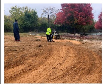
Carlyle Dog Park Project.