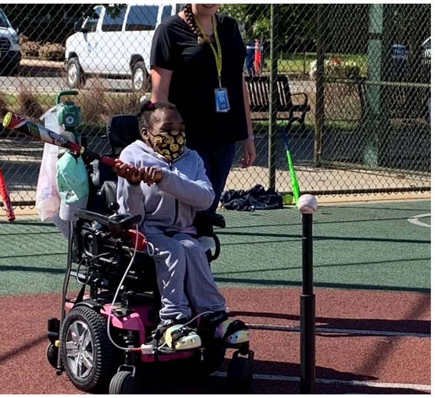
Miracle League of Alexandria ACPS Partnership - Fall 2022