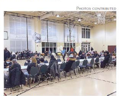
Guests and volunteers enjoy the annual Friendsgiving dinner Nov. 22 at Charles Houston Recreation Center.