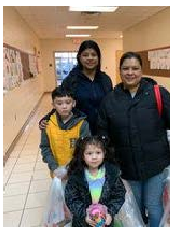
RPCA Community Outreach Toy Giveaway