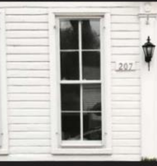
^ 4/4 LATE GREEK / EARLY VICTORIAN