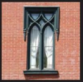
^ GOTHIC LANCET