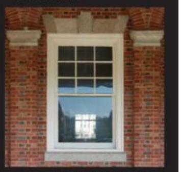
^ COLONIAL REVIVAL /