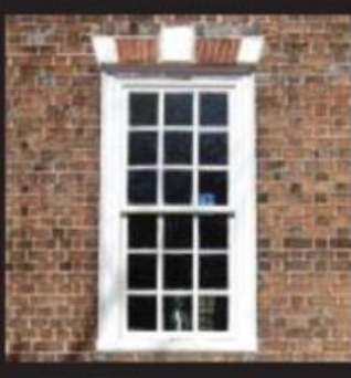
^ 9/9 GEORGIAN