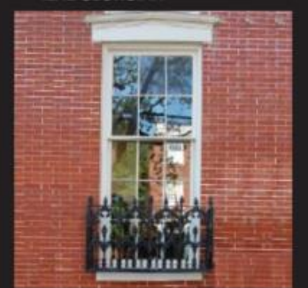
^ 6/9 GREEK REVIVIAL