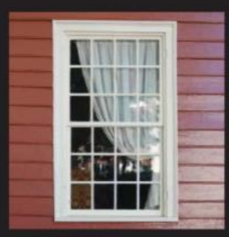
^ 12/12 GEORGIAN