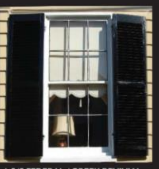
^ 6/6 FEDERAL / GREEK REVIVIAL