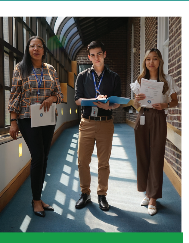
In its 2019 class, the Program employed 10 interns across the City; the 2023 internship has doubled to 20.

Becoming an employer of choice for jobseekers is a key priority for the City of Alexandria. Doing so with the intention of attracting candidates who not only meet the professional criteria, but with a commitment to community and public service can prove to be a challenge. However, it is a challenge the City's Department of Human Resources (DHR) is enthusiastically working to resolve through its Internship Program.