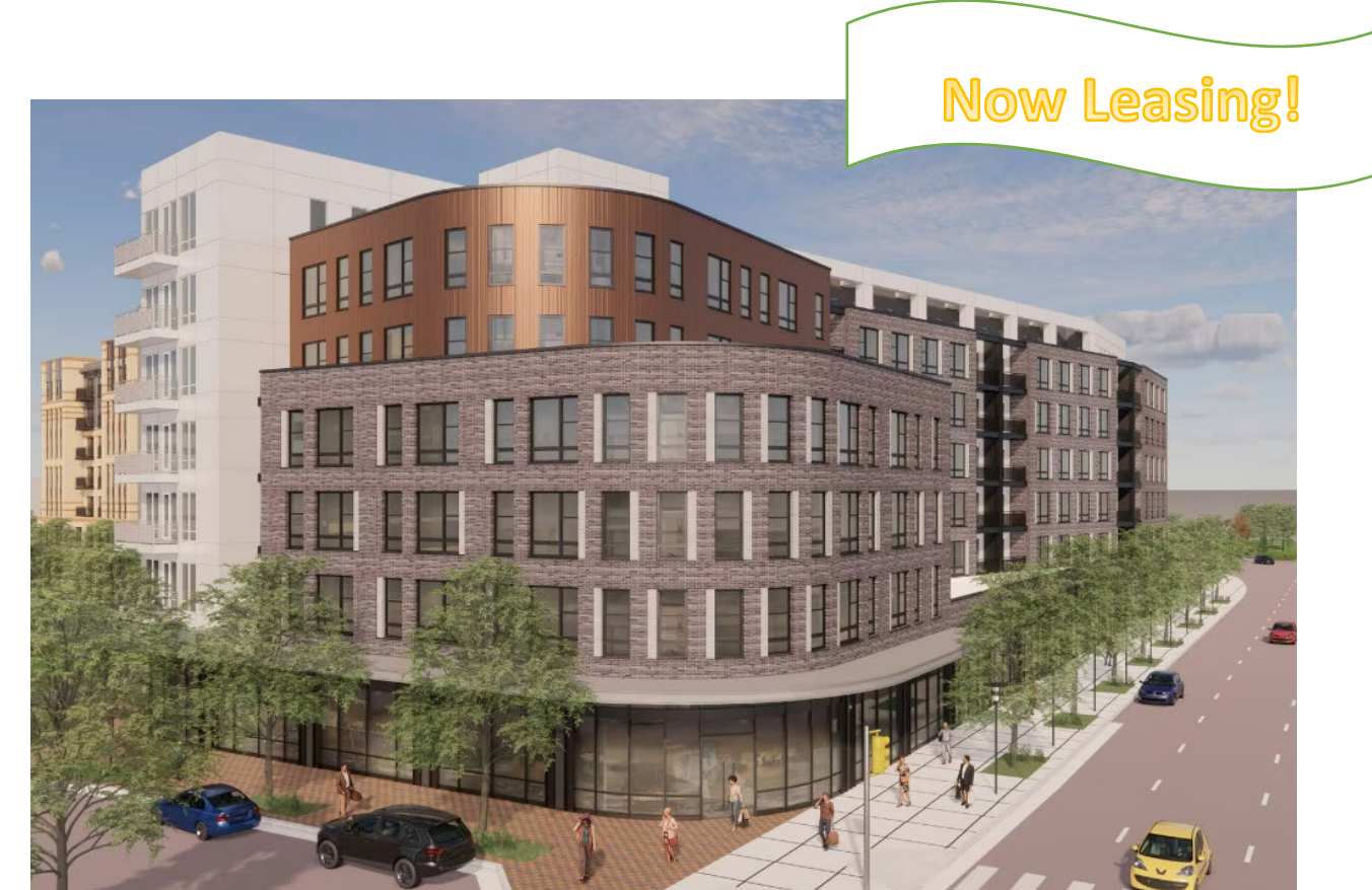
1215 N. Fayette Street, Alexandria, Virginia 22314

Meet Grayson, a new collection of 119 thoughtfully designed apartment residences at the crossroads of all you desire to support your active lifestyle in Old Town Alexandria. Grayson offers spacious 1- and 2- bedroom layouts with modern appointments throughout bright spaces and lush community amenities. Enjoy living perfectly situated within moments to National Landing, famed shops and restaurants of the Old Town Waterfront, and beyond. Ready to set your life on a new adventure?