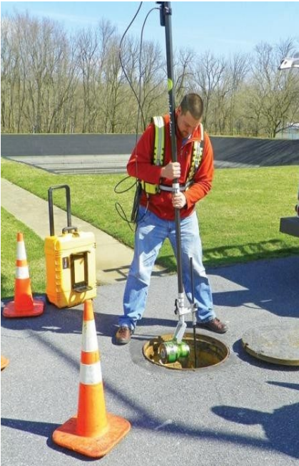
Typical Manhole Inspection, Digital Image. Municipal Sewer and Water Magazine. July 2011. https://www.mswmag.com/editorial/2011/07/get_in_get_out

arrangements will be planned with residents accordingly. There should be minimal disturbance to private property during this work during the sewer inspection. There should be no disturbance to private property during manhole inspections. Sewer service will not be interrupted during the sewer, manhole, or lateral inspections.