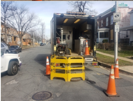
Example of typical CCTV inspection truck setup. In order to conduct CCTV inspections two trucks are needed, one at either end of the sewer.

Inspection of individual sewer segments typically takes 2-4 hours, depending on the length of sewer and number of lateral connections. The sewer segment inspections will consist of opening the manholes at either end of the sewer, inserting a crawling CCTV camera unit at one end and a jetting hose with a cleaning nozzle and root cutter at the other. The sewer will first be cleaned with the jetting hose and root cutter, then once the sewer has been confirmed to be appropriately cleaned the CCTV camera inspection will be performed which will identify the location of defects in the structure of the sewer and any sanitary laterals that enter the sewer from surrounding buildings. Once the sewer inspection is completed an inspection of the City-owned laterals (from the connection to the mainline sewer to just past the curb) will be performed. A different type of CCTV camera will be inserted in the sewer and will inspect each of the laterals individually.