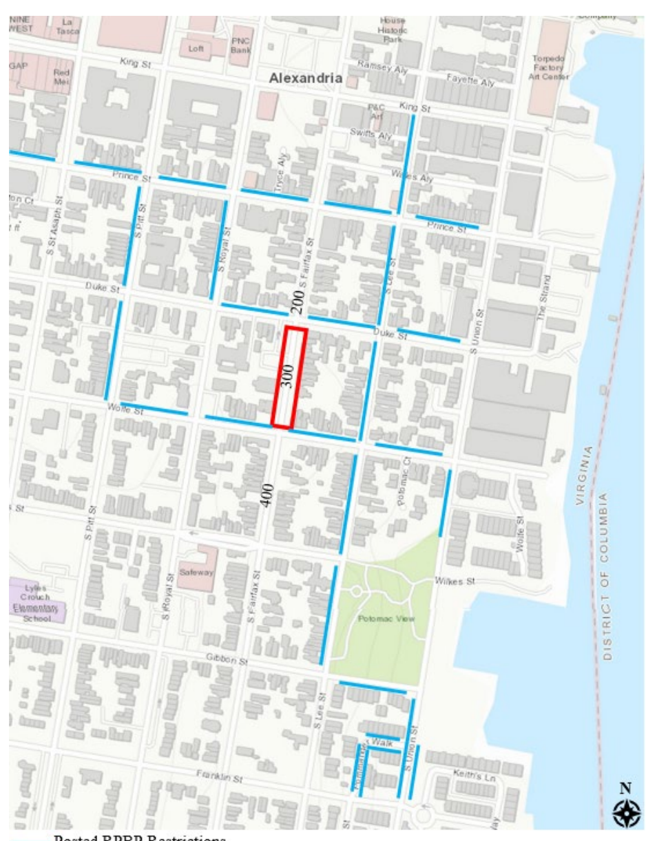
Posted RPBP Restrictions