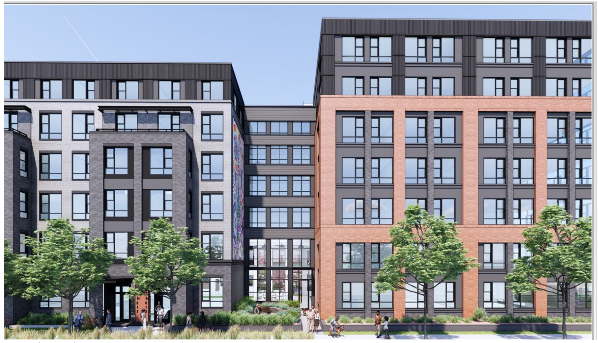
The Pedestrian Experience N. Fairfax