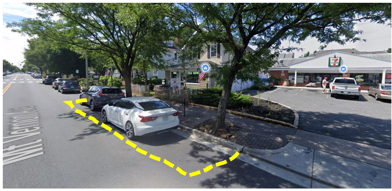
Southbound Mount Vernon Avenue