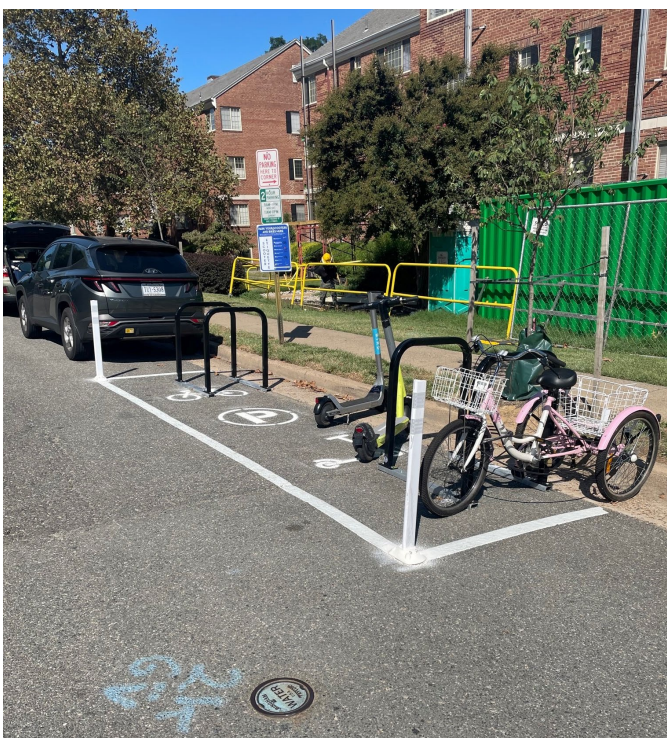
St Asaph & Green corral with bike racks