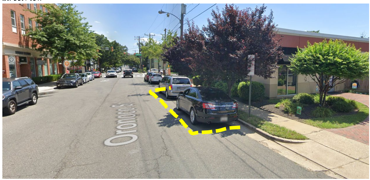
Eastbound Oronoco Street