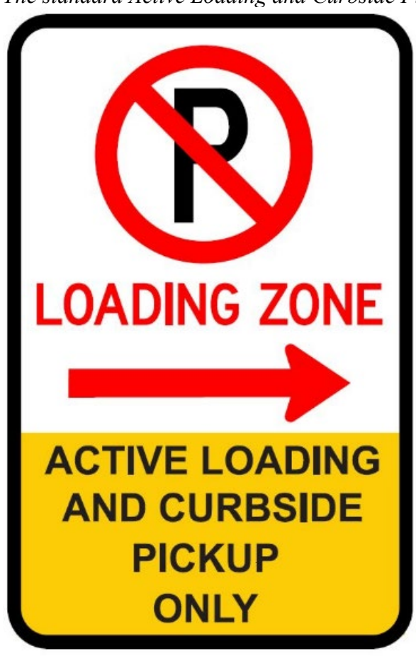
ATTACHMENT 1 : The standard Active Loading and Curbside Pickup Only sign