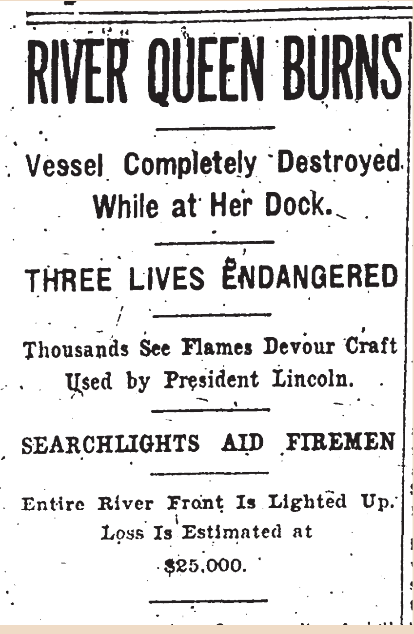
Headline, "River Queen Burns," from the Washington Evening Star, July 9, 1911.

Photograph of Two young African American women, probably somewhere in Virginia, ca. 1910.