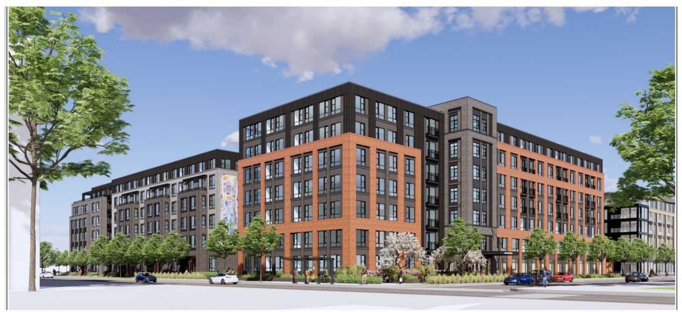
Figure 2 Exterior Elevation

Amenities at The Ladrey project will consist of a landscaped courtyard, a community room, a rooftop terrace, inunit laundry, secure parking, and universal design features in all units. Residents will have access to several bus lines along North Fairfax Street, North Royal Street, and Wythe Street, and will be within walking distance of the Potomac River waterfront and numerous restaurants, services, and retail shops. Exterior features include a pocket park, a mural, and streetscape improvements.