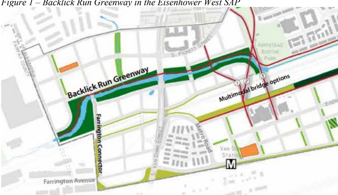
Figure 1 – Backlick Run Greenway in the Eisenhower West SAP

Since constructing the park is in-line with the Small Area Plan (SAP) recommendations, staff are proposing to allow the applicant to credit the cost of the park and the pedestrian/cyclist bridge against the expected Eisenhower West/Landmark Van Dorn Implementation Developer Contributions Policy. Since the budget will not cover the pedestrian/cyclist bridge and the entire park construction, staff requests that the Park and Recreation Commission provide guidance for the prioritization of the current and future park contributions. The park features include: