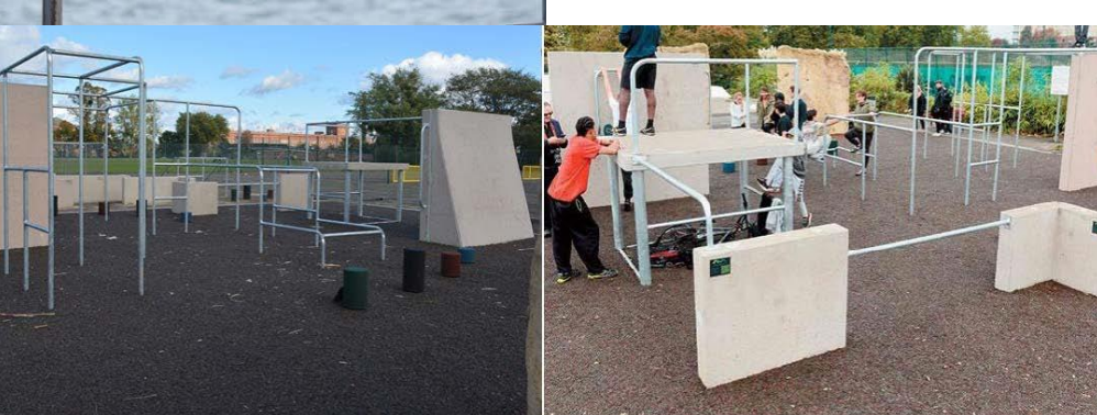
Slough Parkour Park - Slough, Berkshire UK