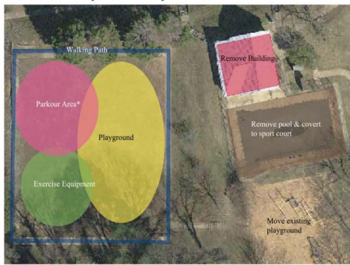
*Parkour is only proposed change from 2016 Neighborhood Parks Improvement Plan