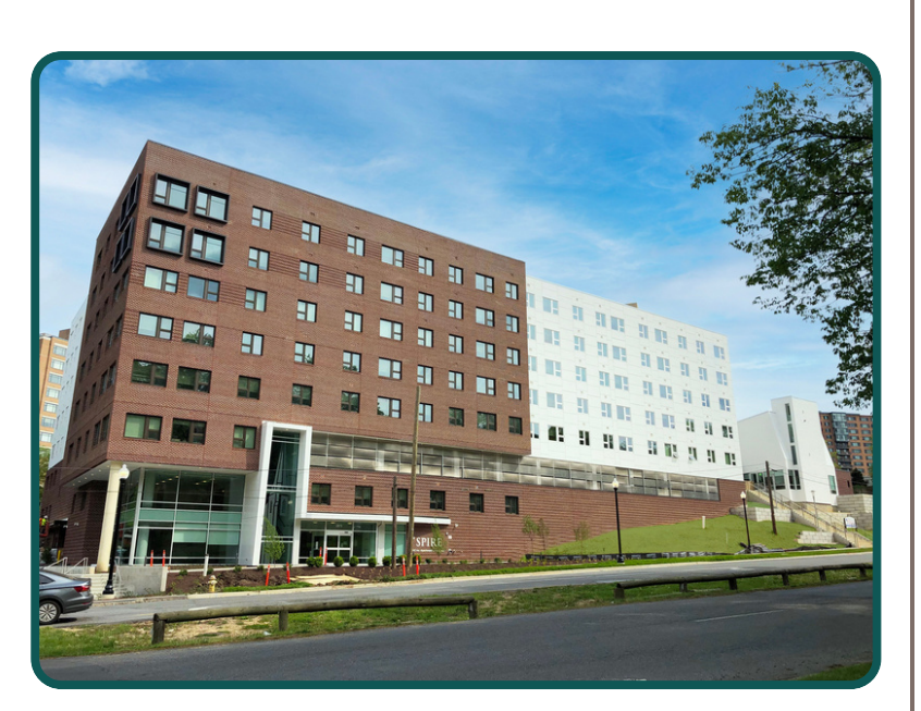
The Spire at N. Beauregard; Photo courtesy of the Office of Housing

Participants in Rental Accessibility Modification Program