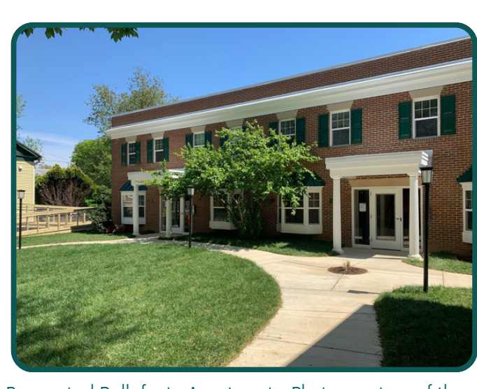
Renovated Bellefonte Apartments; Photo courtesy of the Office of Housing