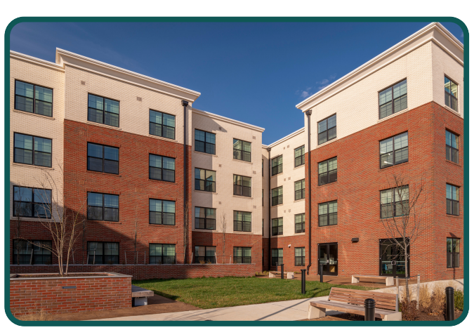
The Waypoint at Fairlington

Units, including units created, converted, and preserved