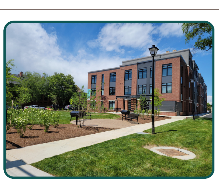
The Lineage at North Patrick Street