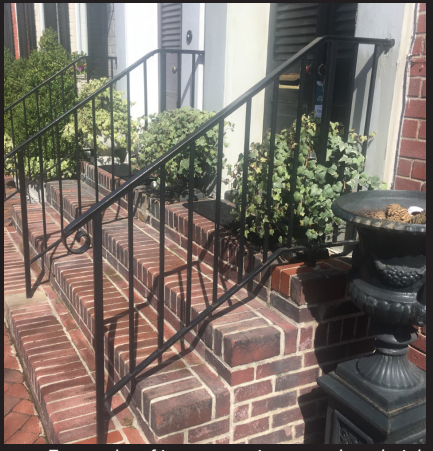
Example of inappropriate modern brick stoop and iron handrail on an Italianate style residence.