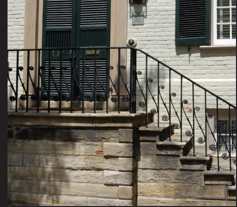
Example of historically appropriate stone steps, iron handrail and guardrail on a Georgian style residence.