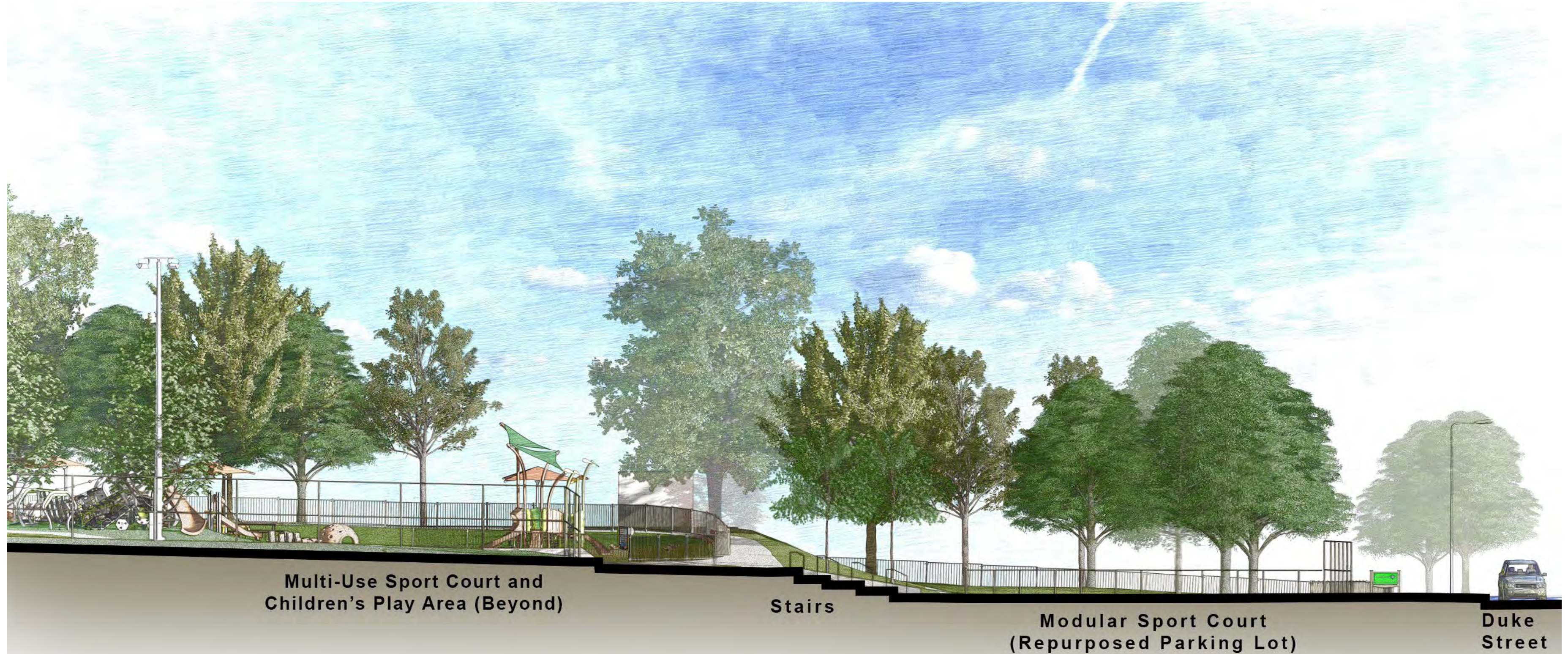
Multi-Use Sport Court and Children's Play Area (Beyond)