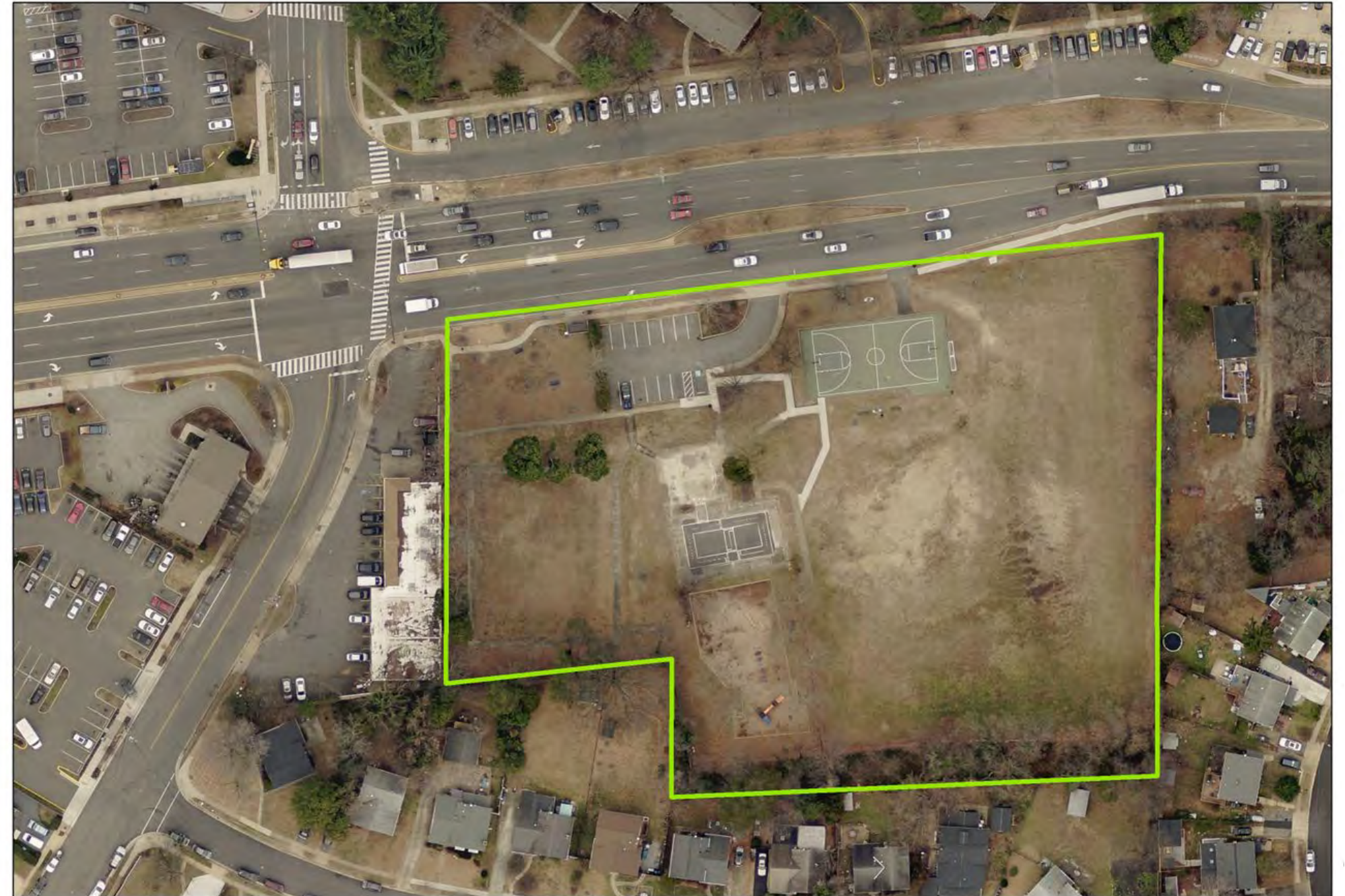
Ewald Park 2023 aerial