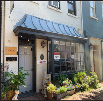
^ FIXED CANOPY