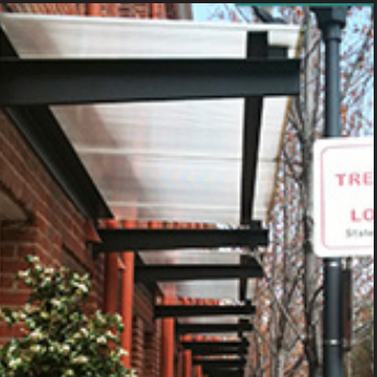
^ RIGID CANOPY