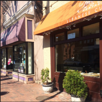
^ FIXED FRAME AWNING