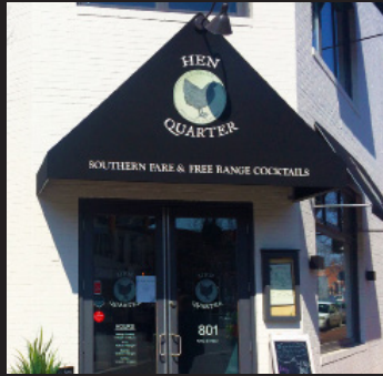
^ FIXED FRAME