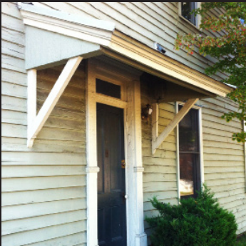
^ DOOR HOOD/FIXED CANOPY