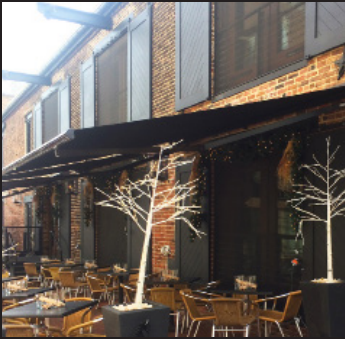
^ RETRACTABLE AWNING