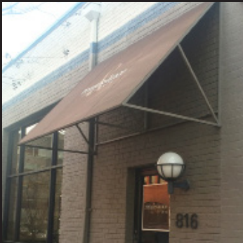
^ FIXED FRAME AWNING