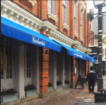
^ RETRACTABLE AWNING