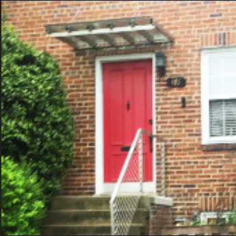
^ RIGID CANOPY