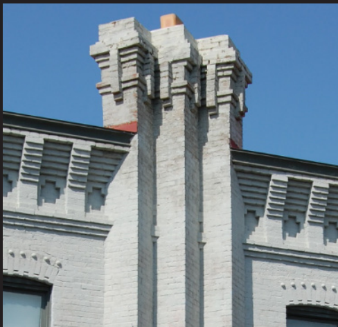
The corbelled brick chimney is a character-defining feature of this Queen Anne-style residence.