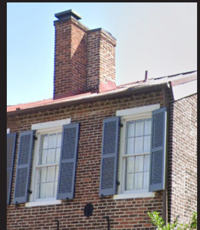
Example of brick chimneys commonly found on historic Old Town residences.