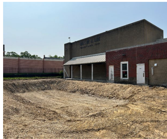
June 12, 2025

All park districts were busy with mowing activities and general maintenance resulting from the excessive rain through the month of May and into early June.