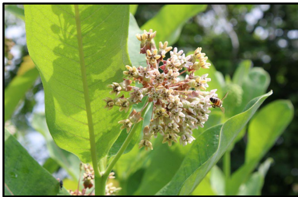
Milkweed with Bee

In the past month, the natural resources division has been performing visits of natural areas throughout the City of Alexandria to inform existing conditions and consider potential management needs, as well as creating a 5-year plan for understanding priorities following the four guiding principles found in the 2019 Natural Resource Management Plan. For Management , the natural resources division is pursuing avenues for a comprehensive natural resources inventory. This will aid in updating the natural resource management plan by providing context of existing conditions of flora, fauna, and habitat. For Conservation , the division continued to develop a solicitation for an invasive plant control contract. In addition, the division is in the beginning stages of researching and developing wildlife management for the City of Alexandria. For Restoration , the division has met with park planning at Mt. Jefferson Park and talked about potential future opportunities for collaboration. Finally, for Community , the natural resources division has connected with several community-facing organizations, including the Beautification Commission, Community Gardens leadership, and Adopt-A-Park. The division has also been developing plans to update the Natural Resources webpages to be more intuitive and transparent for the public.