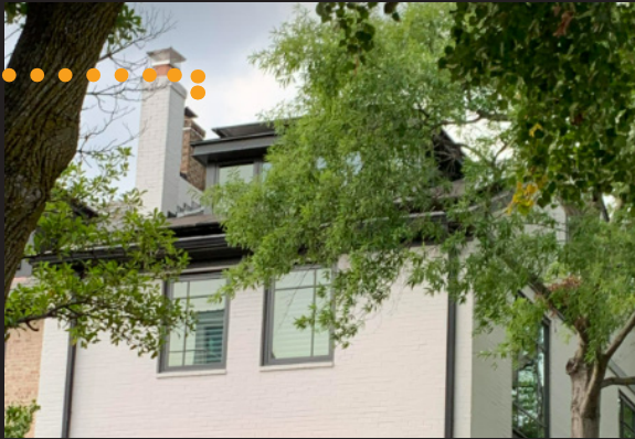
Example of a minimally visible roof mounted solar panel.