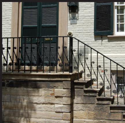
Example of historically appropriate stone steps, iron handrail and guardrail on a Georgian-style residence.