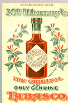
Tabasco sauce ad, 1905 Advertisement for Tabasco sauce, 1905.

Tabasco sauce remains a favorite in MREs for U.S., Australian, British, and Canadian forces and has been used in NASA’s space missions, including Skylab and the International Space Station. According to the McIlhenny Company, Tabasco sauce can now be easily found in 195 countries and is labeled in 36 languages and dialects.