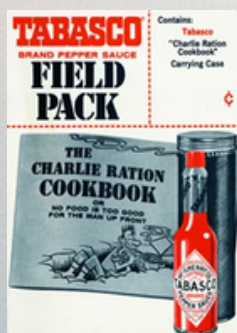
Advertisement for the Tabasco Brand Pepper Sauce Field Pack, containing a small bottle of the condiment, The Charlie Ration Cookbook, and a mailing tube-carrying case, circa 1966.