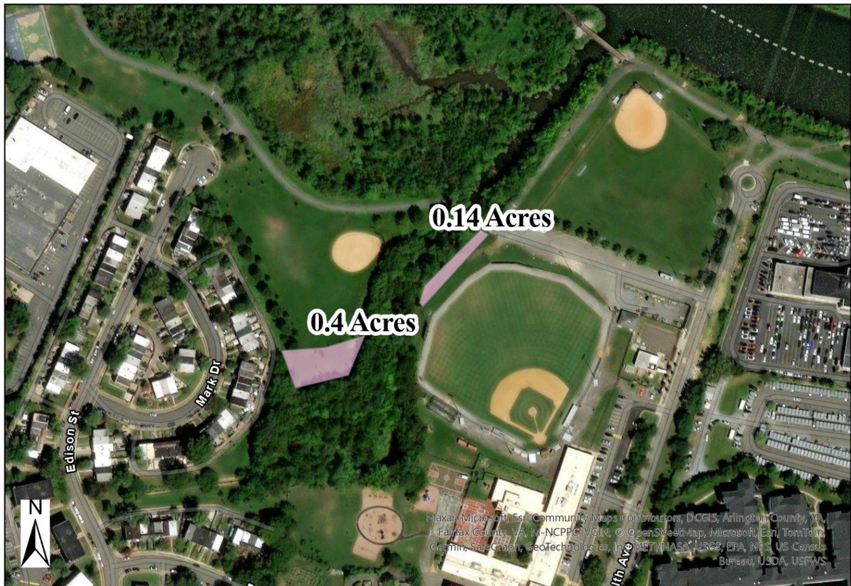
Habitat Restoration Areas in Four Mile Run Park