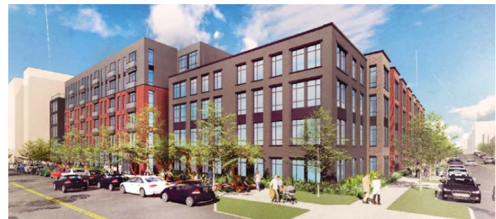
View at the corner of Wythe Street & N. Pitt Street