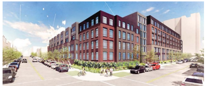
View at the corner of Pendleton Street & N. Royal Street