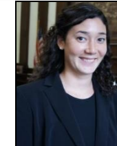
DPI RPCA/NVRPA T&ES/Transit CIP Back-up