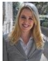
Fire DEC Human Resources City Council/City Clerk City Manager's Office OCPI Code