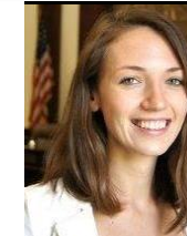
ACPS/NVCC DCHS Health/Other Health