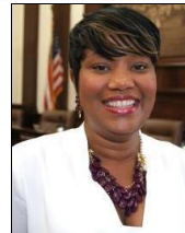
Revenues Five Year Financial Planning Model Finance Economic Development