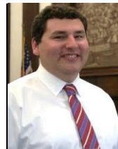
Operating Budget Non-Departmental BFAAC liaison