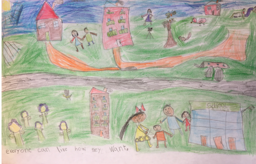
Fair housing through the eyes of a kindergartener at William Ramsey Elementary

prevent potential renters or homebuyers from living where they want to based on how they may look or talk, how they choose to worship, the language they speak at home, or a disability.